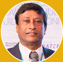
Deo Prasad UNSW Center