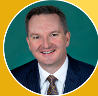
Hon. Chris Bowen AU Parliament