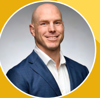
David Pocock Independent Senator, ACT