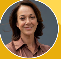
Dr Sophie Scamps Mackellar