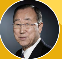
Ban Ki Moon Former UN Member