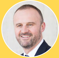
Andrew Barr ACT Chief Minister