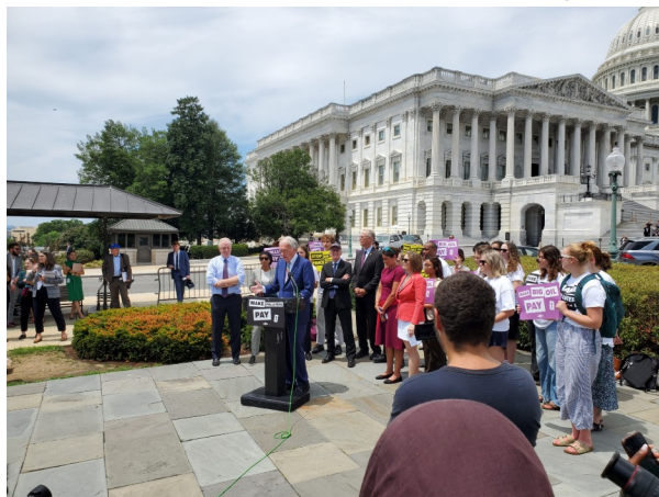
U.S. Senator, Ed Markey (MA) speaking (7-23-24).

Later in July, Climate First! attended the “Make Polluters Pay” Press Conference & Rally” to hold big oil accountable for the harms caused by climate change.