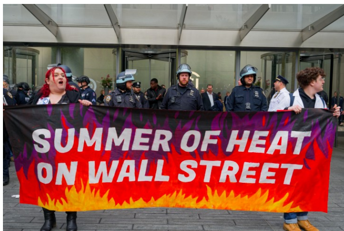
Activists, on the second day, getting the message out

Towards the end of April, Climate First! traveled to New York City for two consecutive days of actions at Citibank’s headquarters (HQ) in Manhattan. This “spring spark” was a prelude to the upcoming Summer of Heat on Wall Street campaign, an effort that would often use nonviolent civil disobedience to get the massive climate-polluter Citi and others to divest from fossil fuels.