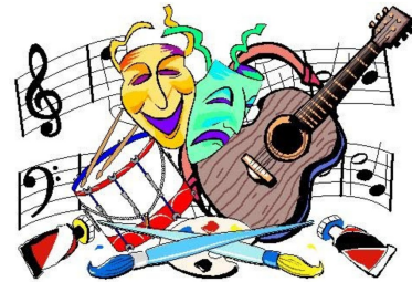
Integrated Art Circles 2023

Integrated Art Circles 2024 offers artists an opportunity to use their art and teaching skills to bring residents together to have fun while learning a new art form and building relationships with other participants of different races and backgrounds. The Community Coalition's Integration through the Arts Committee has limited positions in 2024 for artists to lead these small community groups called Circles for an honorarium. To receive an application and more information, send an email to SOMACCR.Arts@gmail.com including your full name, telephone contact and your art discipline.