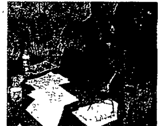
South Orange/Maplewood residents discuss projects and make suggestions at Coalition on Race's Annual Report to the Community.