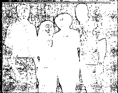
Dreamcatcher Repertory Theater brought Race scenarios to life in a group discussion.