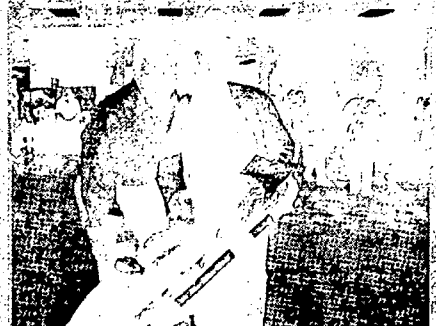
Community members participating in the Patchwork Open House

"Initiating the Coalition on Race didn't go overnight and didn't happen overnight. It's been a journey. I've learned a lot from the South Orange/Maplewood Community."