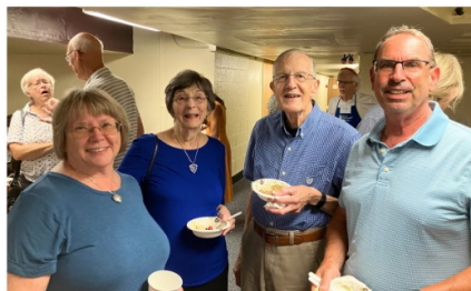
Ice Cream Sundaes on Sunday