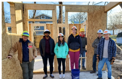
Habitat for Humanity Service Project