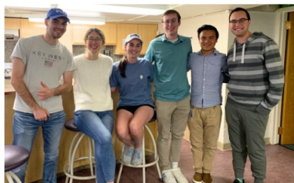
Young Adult Bible Study