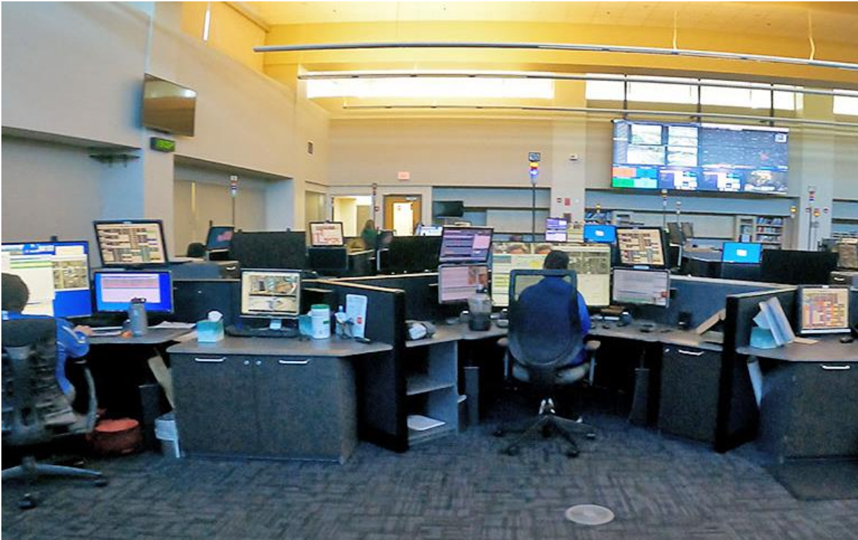
The Dakota Communications Center handles the county's 911 calls. dakota911mn.gov

https://www.minnpost.com/mental-health-addiction/2022/05/anytime-anywhere-anyone-how-dakota-county-has-expanded-its-mental-health-crisis-services-and-shifted-away-from-police-involvement/