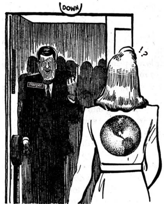
Beware of climate zombies.

In fact the Senate voted it down, in an unheard of act, with no debate. Prime Minister Harper ordered the vote while many Liberal Senators were not in the Chamber. Harper has done what he has long said he would not do, use an unelected body to interfere with law in this country.