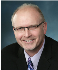
Senator Chamberlain District 38

Students with dyslexia have also received support from other Senators and we thank them all!