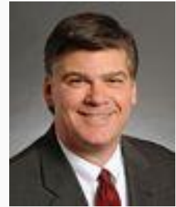
Senator Pratt District 55