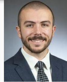
Rep. Cantrell District 56A