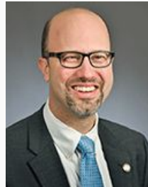
Rep. Pinto District 64B