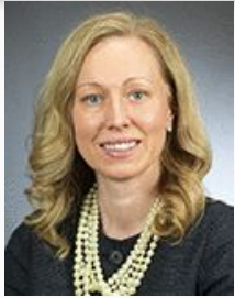
Rep. Edelson District 49A

Representatives shown are authors as of March 4, 2019.