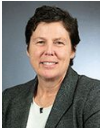
Rep. Acomb District 44B