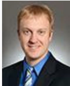
Senator Eichorn District 05