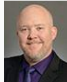
Senator Isaacson District 42