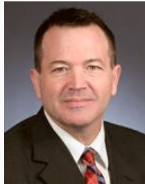
Rep. Lillie District 43B

Representatives shown are authors as of March 4, 2019.