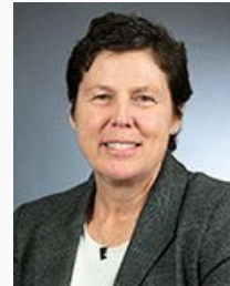
Rep. Acomb District 44B