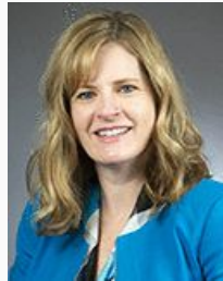
Rep. Moller District 42A