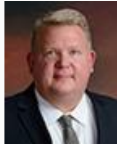
Senator Draheim District 20