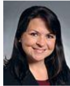
Senator Kent District 53