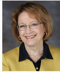
Rep. Runbeck District 38A