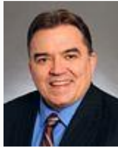
Senator Hoffman District 36