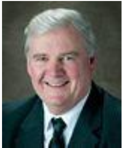
Senator Clausen District 57

Other Senators have also been supportive of students with dyslexia and we thank them all!