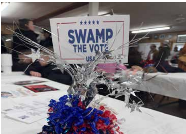
Swamp the Vote