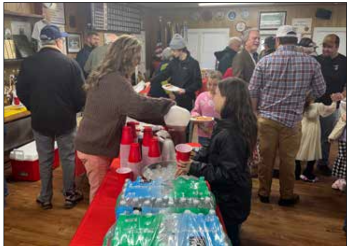
The Meet & Greet included a Hot dog Social with all the fixings.