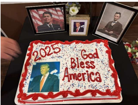
Happy Birthday Mr. President!