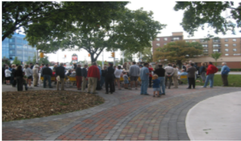
The maple tree in its former glory at the opening of the park.

You may have noticed that the maple tree closest to the intersection is being removed. While the tree had been pruned repeatedly, after weathering its last storm, it was badly damaged. We will ensure that under the new designs a replacement tree will be planted.