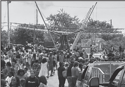
North Preston Day had a big turnout on July 15, with a long line for the kids' favourite, a combined bungee jump/trampoline.... plus a colourful parade and an endless supply of hotdogs and snow cones.