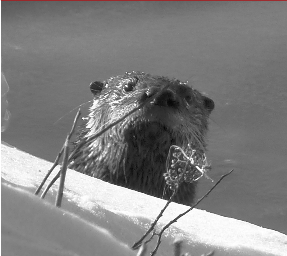
A photographer meets an unusually friendly otter on the ice in Clam Harbour—see page 6.