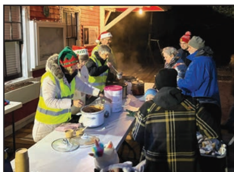
Warming up at the fire pits, The Lions serving Chili, the Ginger Bread Express and people listening to the music in front of the Polar Bear Express. Looks like everything went as planned at this year's Parade of Lights . So nice to see the community come together for this event and many volunteers this year made it alot easier. Thank You!