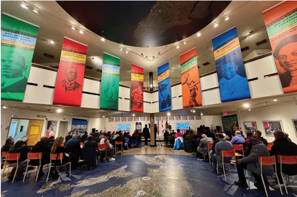
In the Black Cultural Centre's soaring banner hall, floor-to-ceiling displays introduce historic African Nova Scotians alongside cultural milestones and community stories. (See Page 5.)