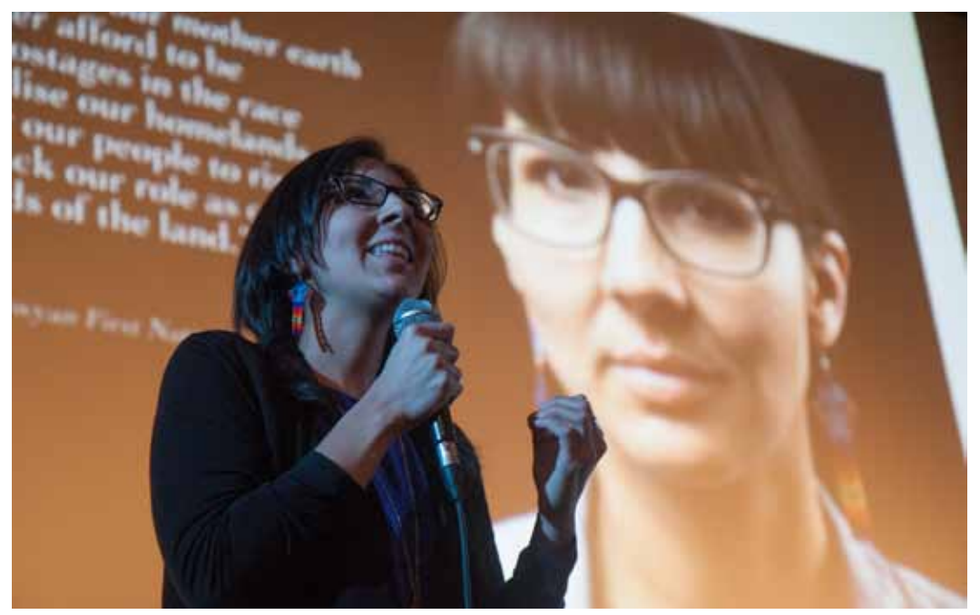
April 13th, 2014 - At the Mayfair Theatre in Ottawa, around 250 people came out to attend a session informing people about the concerns over the proposed Energy East pipeline.

to ensure flow) through our region. In addition to the potential impact of any spill on Ottawa's local water supplies and to our health, Energy East would allow the Alberta tar sands to increase production by nearly 50 per cent, which, in environmental terms, would effectively undo the reductions in greenhouse gas emissions achieved by shutting down Ontario's coal plants.