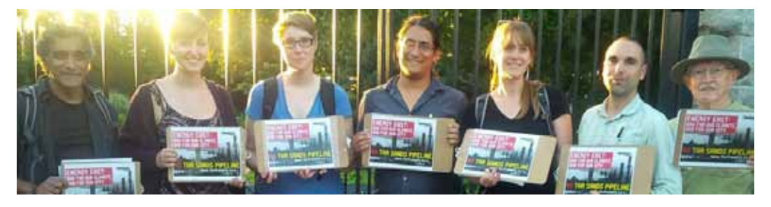
Tar Free 613

TransCanada's proposed Energy East pipeline is a national project with environmental implications for any municipality it passes through. Ecology Ottawa began work in mid-2013 raising awareness about the proposal to retrofit a natural gas pipeline to carry crude oil and highly volatile hydrocarbons (diluents