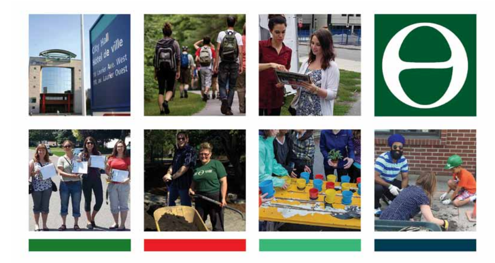
ECOLOGY OTTAWA ANNUAL REPORT