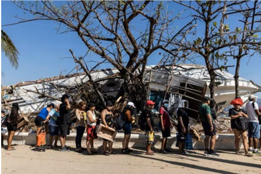
People line up to receive aid in Acapulco, Mexico, after Hurricane Otis, on 3 November 2023. Photograph:

climate-change-is-affecting-fijians-mental-health-219506?utm_medium=email&utm_campaign=Latest%20from%20The%20Conversation%20for%20January%209%202024%20%202844128828&utm_content=Latest%20from%20The%20Conversation2