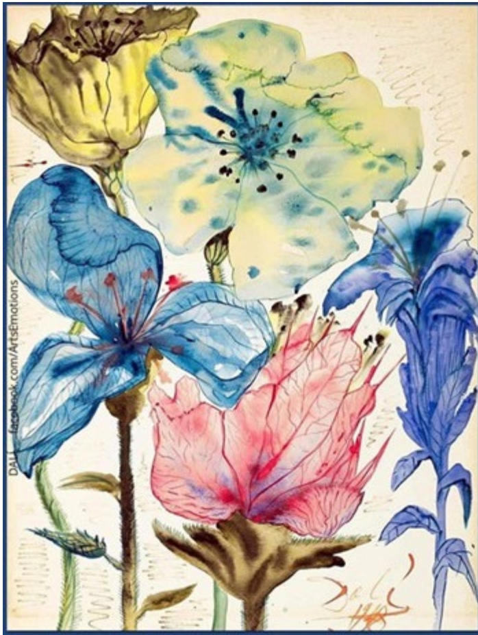
Painting by Salvatore Dali