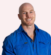
David Pocock, new Senator for the ACT