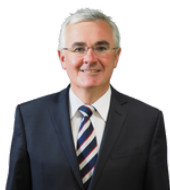
Andrew Wilkie, returned MP for Clark