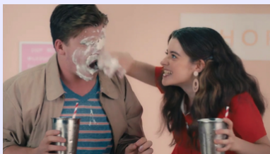
Image above: a scene from the infamous milkshake consent video released in the Good Society resources

In the weeks that followed, many of the pieces of harmful content we had highlighted were removed from the Good Society website.