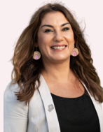
Lidia Thorpe, re-elected Senator for Victoria