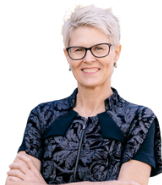
Penny Allman-Payne, new Senator for QLD,