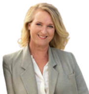
Kylea Tink, new MP for North Sydney