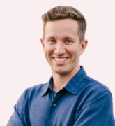
Max Chandler-Mather, new MP for Griffith