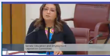
Image above: Senator Mehreen Faruqi questioning the Department during Senate Estimates