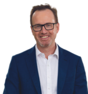
David Shoebridge, new Senator for NSW