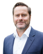
Peter Whish-Wilson, re- elected Senator for TAS