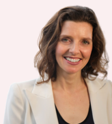
Allegra Spender, new MP for Wentworth