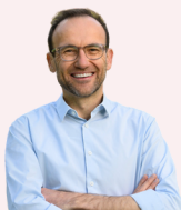
Adam Bandt, MP for Melbourne