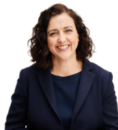
Dr Monique Ryan, new MP for Kooyong,