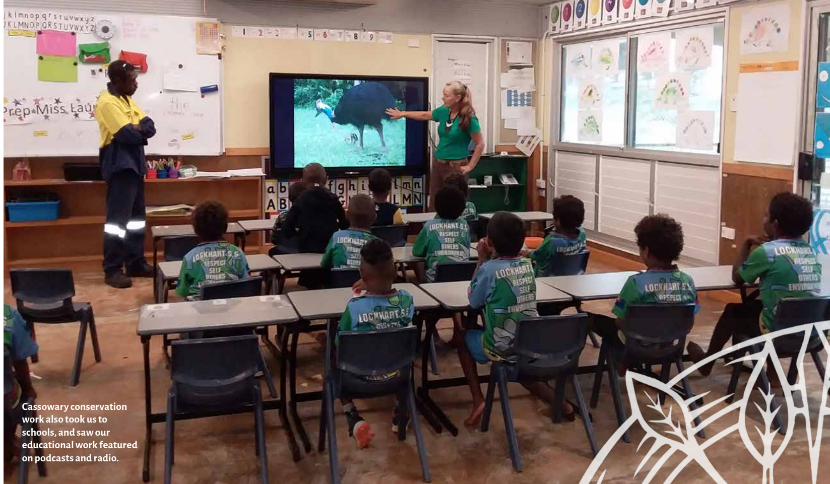
Cassowary conservation work also took us to schools, and saw our educational work featured on podcasts and radio.

Friends of the Earth have launched a National PFAS Map which has made an important contribution to the national and international conversation on PFAS. Through our Defence of Earth project, we also met with communities who are currently on the frontline of PFAS contamination from military bases.