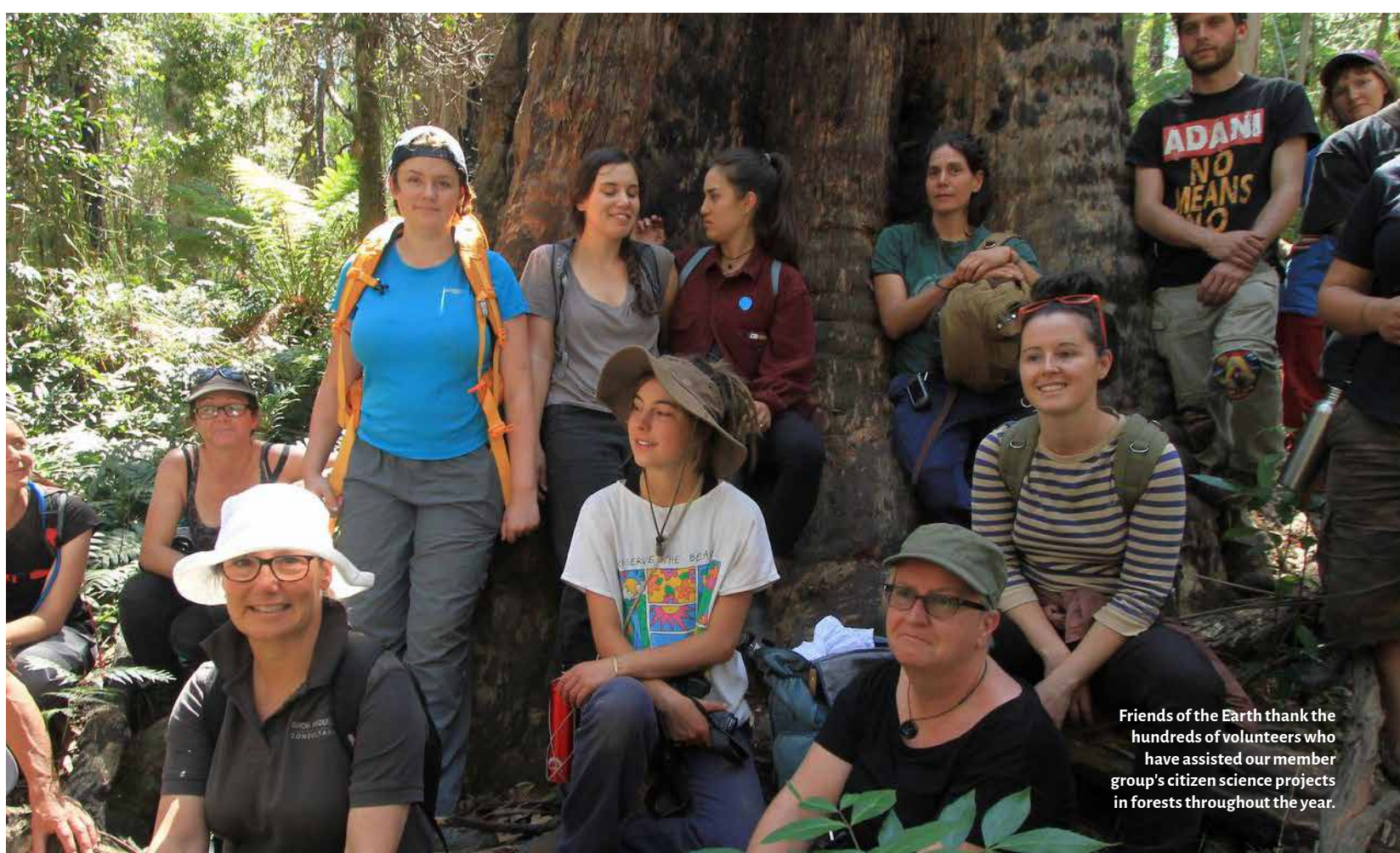
Friends of the Earth thank the hundreds of volunteers who have assisted our member group's citizen science projects in forests throughout the year.