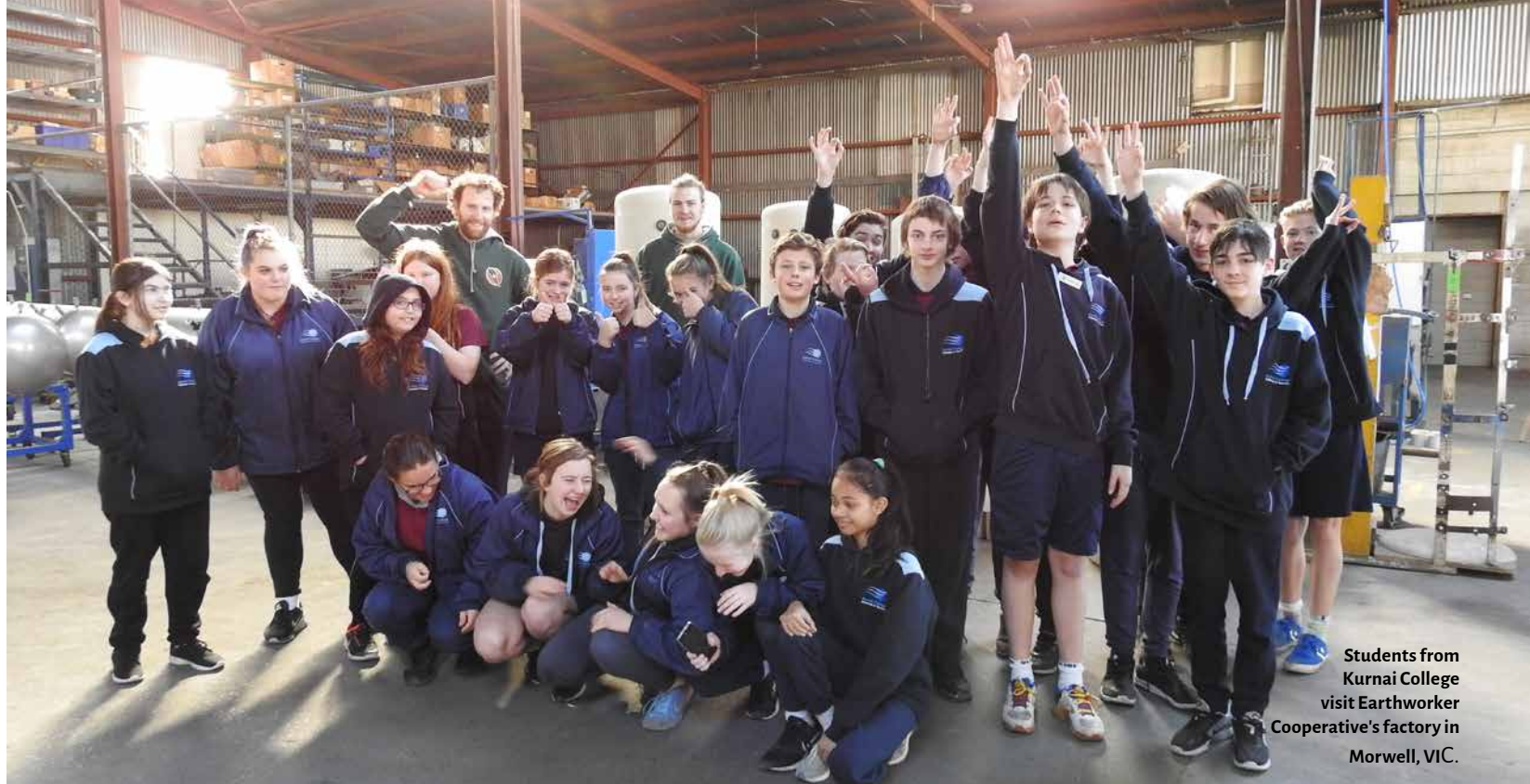
Students from Kurnai College visit Earthworker Cooperative's factory in Morwell, VIC.