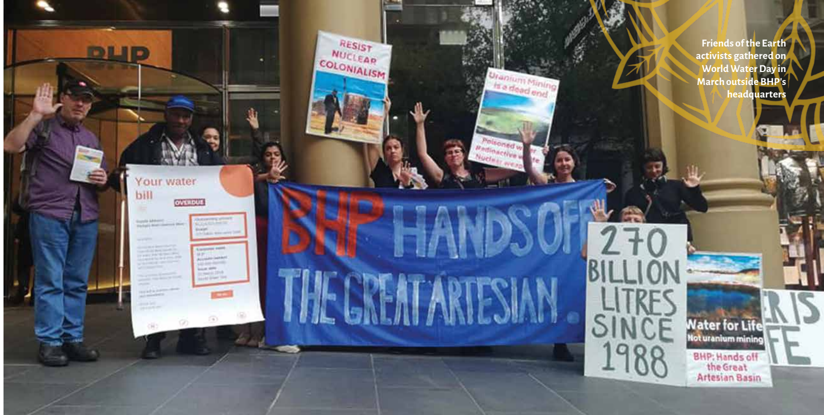
Friends of the Earth activists gathered on World Water Day in March outside BHP's headquarters

Friends of the Earth Australia was founded 45 years ago opposing a nuclear plant in Victoria. To this day we have been involved in the resistance against all stages of the nuclear cycle - mines, power, weapons and waste.