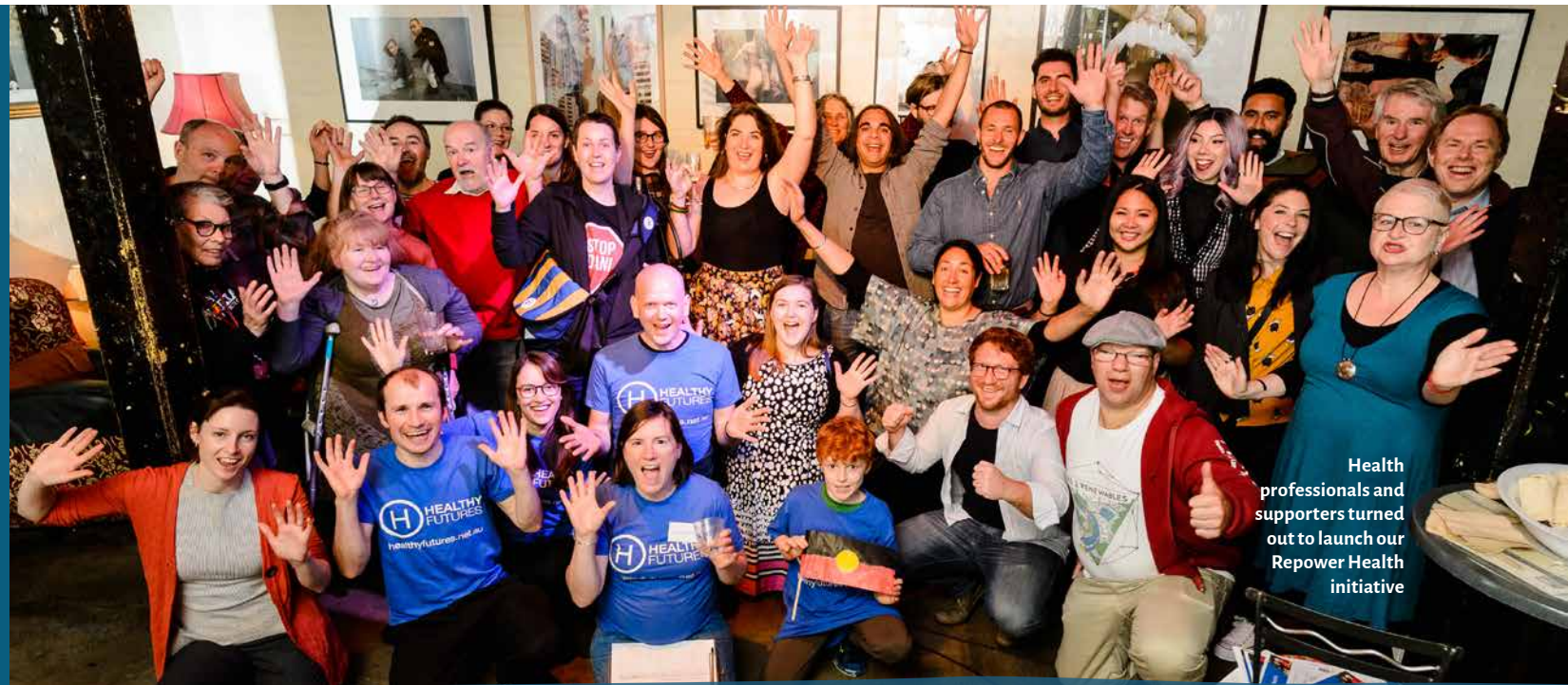
Health professionals and supporters turned out to launch our Repower Health initiative

Meanwhile we've continued our advocacy for health superannuation funds HESTA and First State Super to divest from fossil fuels, and for EPA Victoria to set air pollution limits for Victoria's coal-fired power stations in line with international standards to protect health.