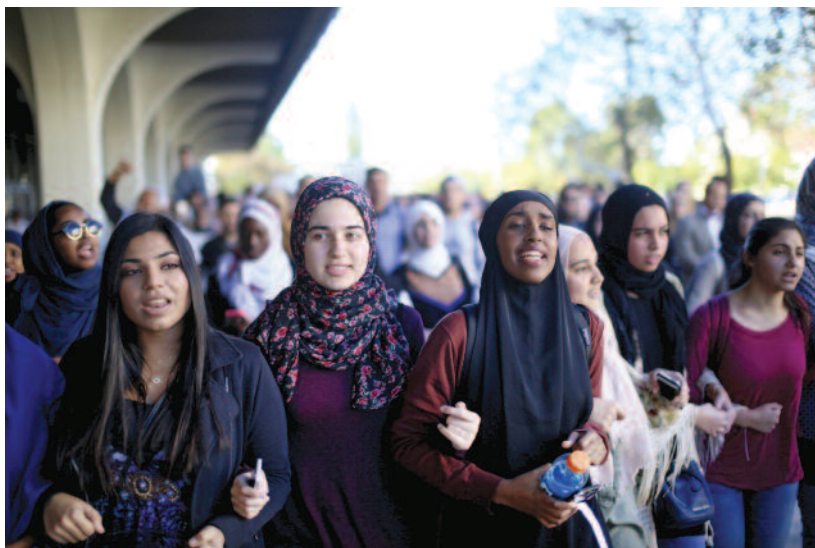
Students chant while marching at a rally against Islamophobia at San Diego State University in San Diego, California.

Just as women in the US struggle for equality and gender justice, so too do women in Muslim-majority nations. And while women (and some men) doing this work have sometimes labeled themselves feminists, they are more frequently identified that way by historians, and derisively by political opponents. Those women who have met with the most success have frequently grounded their appeals to a Muslim commitment to justice. In this work they have been strongly supported by women’s scholarship to re-examine both primary sources of the Islamic faith: the Quran and the Hadith .