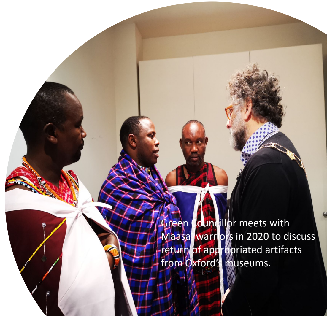
Green Councillor meets with Maasai warriors in 2020 to discuss return of appropriated artifacts from Oxford’s museums.