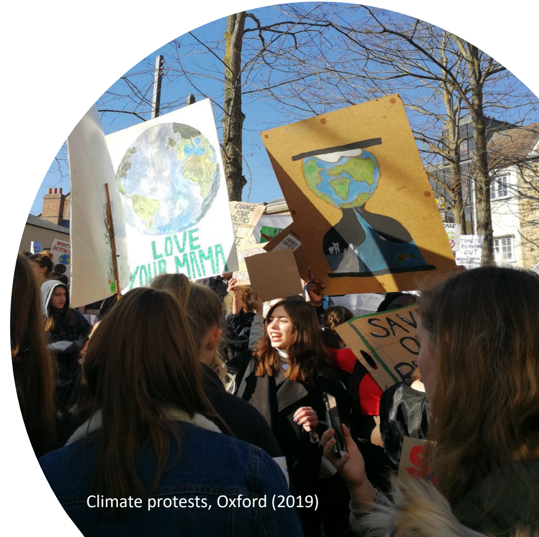
Climate protests, Oxford (2019)

Only the Greens are in a position to hold the Council to account and make sure they deliver on these aspirations.