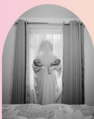
Amak Mahmoodian Photography 6, 20 & 27 May