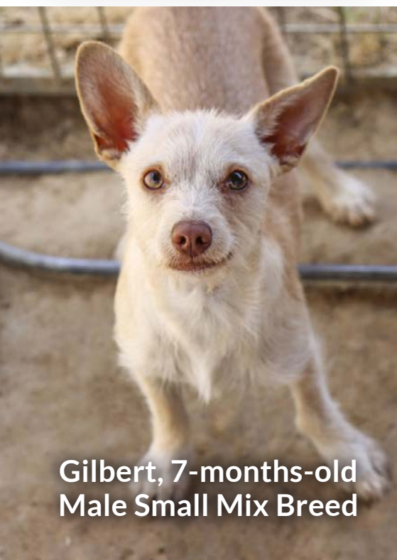
Gilbert, 7-months-old Male Small Mix Breed