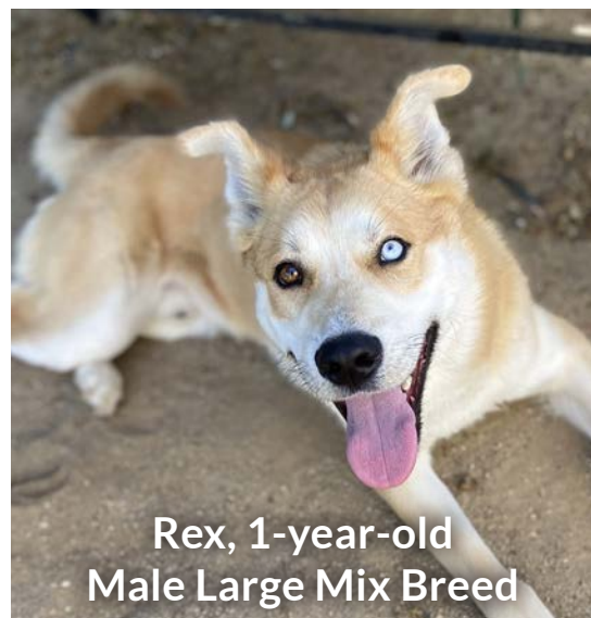
Rex, 1-year-old Male Large Mix Breed