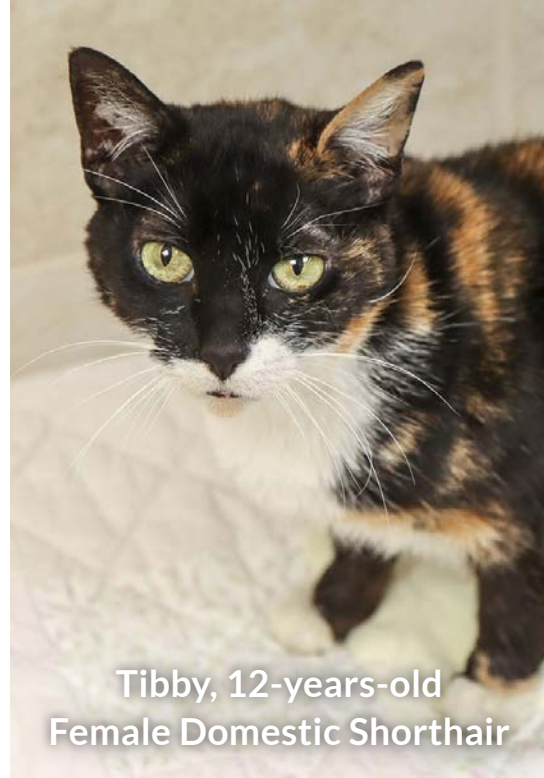
Tibby, 12-years-old Female Domestic Shorthair