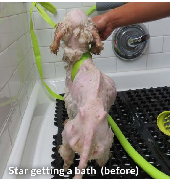
Star getting a bath (before)