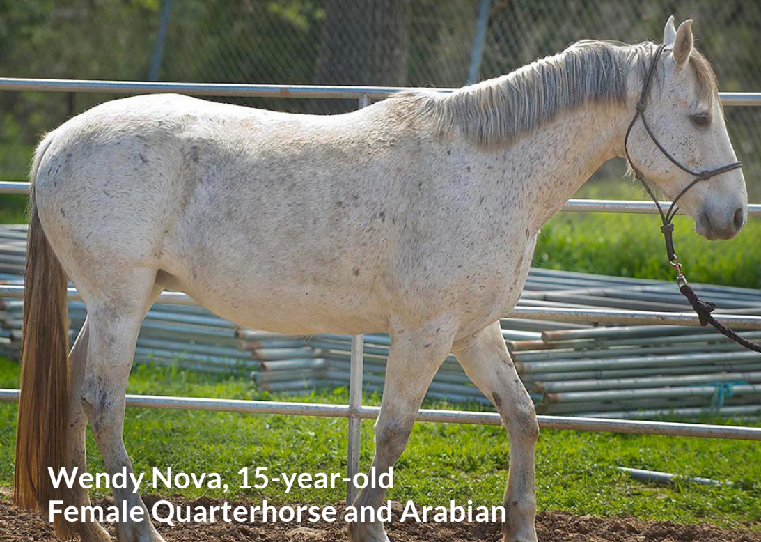
Wendy Nova, 15-year-old Female Quarterhorse and Arabian