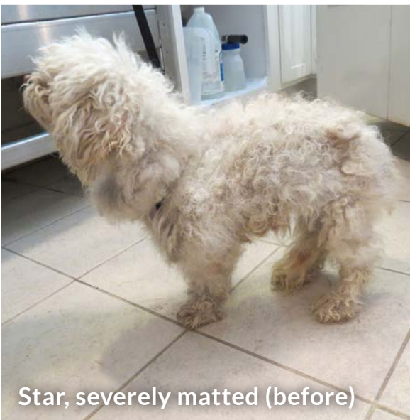
Star, severely matted (before)