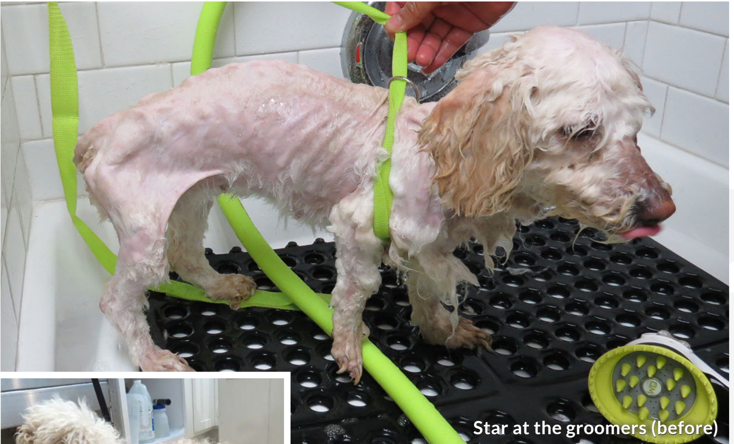
Star at the groomers (before)