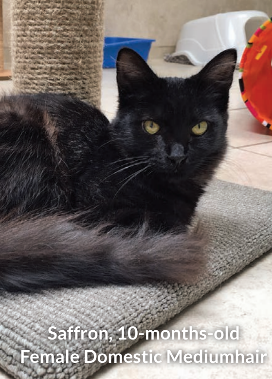
Saffron, 10-months-old Female Domestic Mediumhair