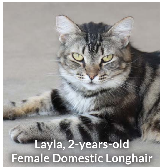
Layla, 2-years-old Female Domestic Longhair

Check out some of our adoptable furry friends!