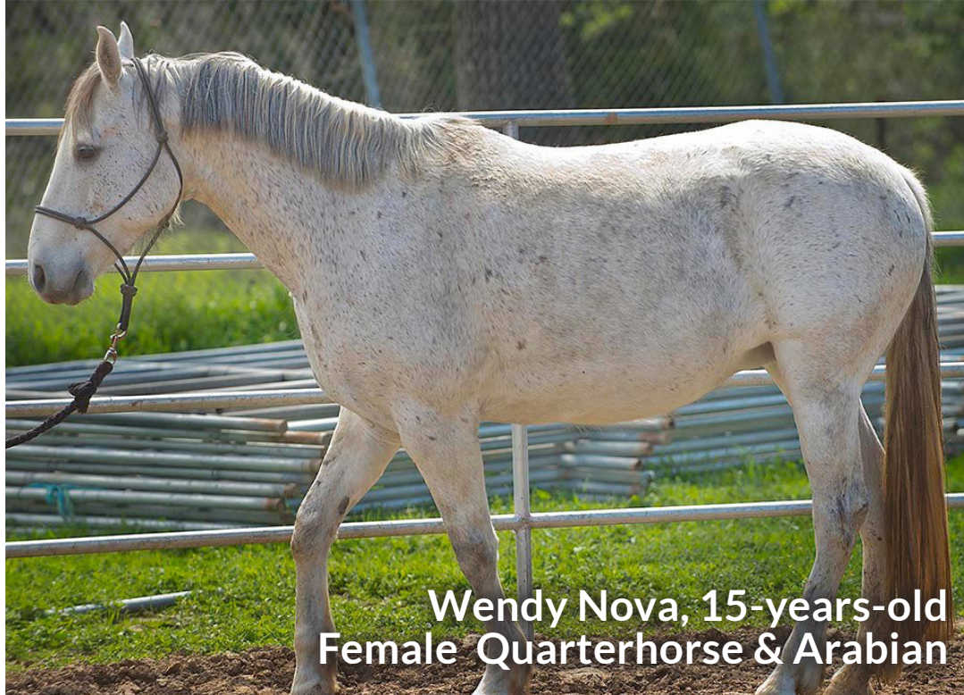
Wendy Nova, 15-years-old Female Quarterhorse & Arabian