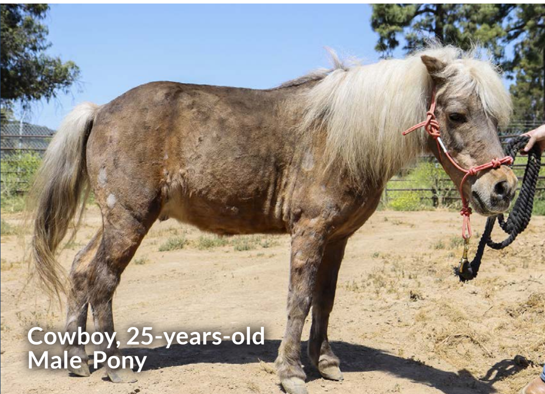
Cowboy, 25-years-old Male Pony