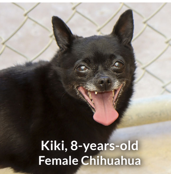
Kiki, 8-years-old Female Chihuahua