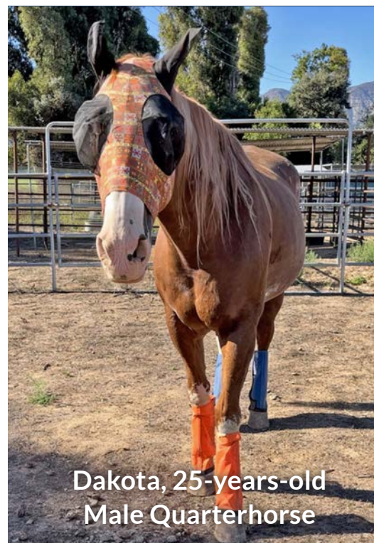
Dakota, 25-years-old Male Quarterhorse