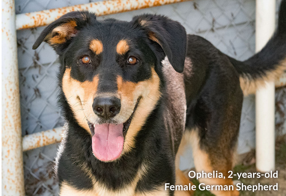
Ophelia, 2-years-old Female German Shepherd