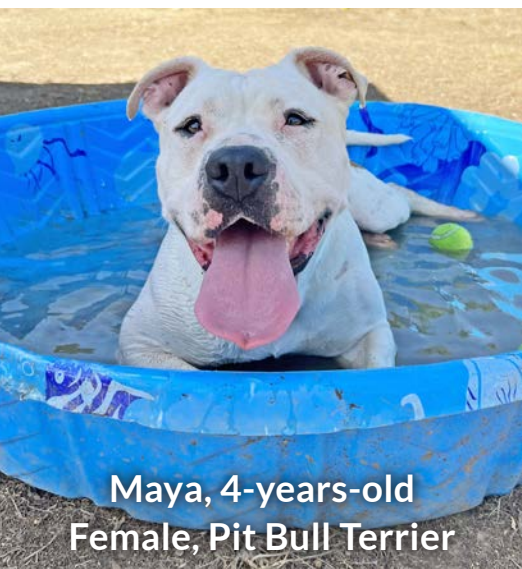
Maya, 4-years-old Female, Pit Bull Terrier