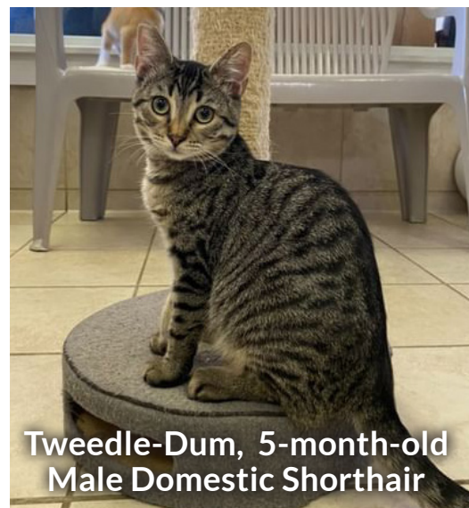
Tweddle-Dum, 5-month-old Male Domestic Shorthair