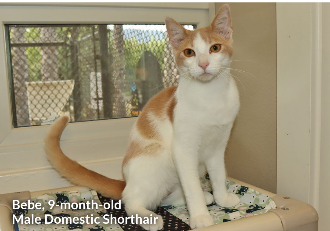
Bebe, 9-month-old Male Domestic Shorthair