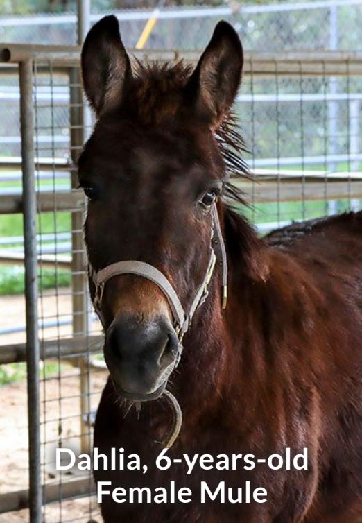
Dahlia, 6-years-old Female Mule