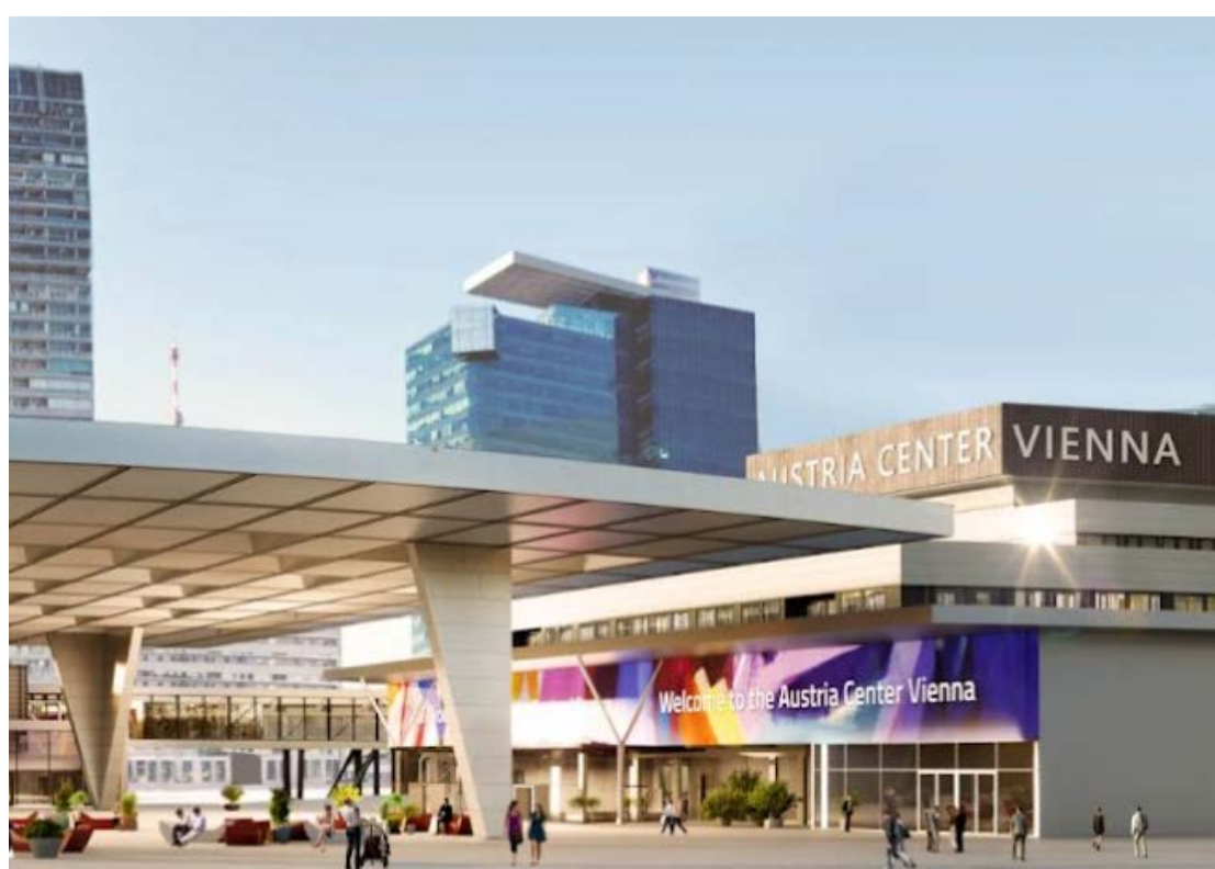
Austria Center Vienna