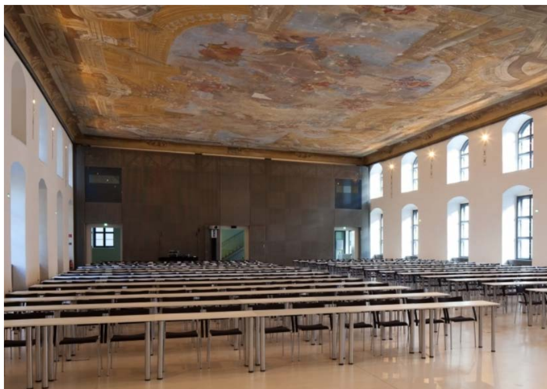
Aula der Wissenschaften, Jesuitensaal