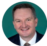
Minister for Climate Change, Hon Chris Bowen