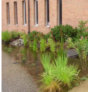
St. Martin Rain Garden