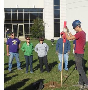
Tree planting at a Jewish Synagogue

Join Blue Water Baltimore and Interfaith Partners for the Chesapeake at the free Walk the Talk forum on Sunday, April 26 to learn how faith communities in Baltimore have worked to make a difference towards decreasing stormwater runoff.