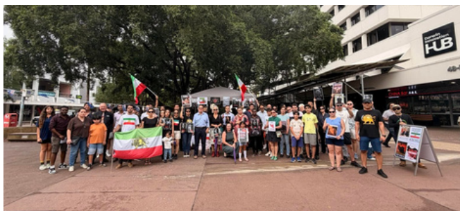
Joining with the Iranian Community for a rally.

I joined with the Iranian community and supporters to stand against the violence in Iran. This is a terrifying time for our Iranian friends, and those from the region, and we stand with them.