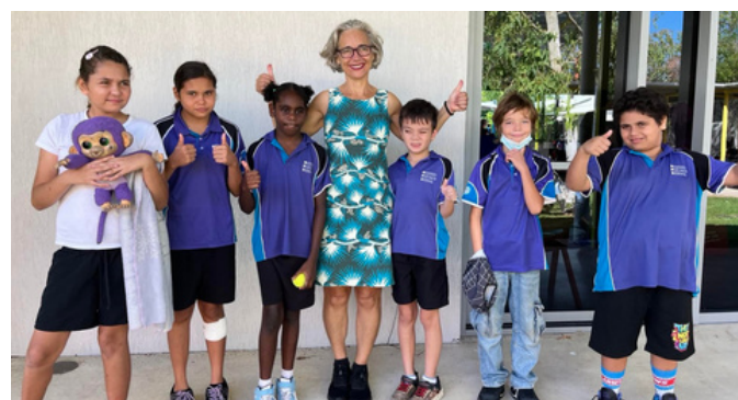
Ready to go for Term 1!

If there is an issue or organisation that you think is important for me to know about, please get in touch.