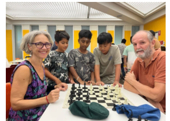
In order from top left: Darwin Fringe Festival Launch, Farewell to the Shorebirds, UN Day of Sport for Peace and Development, Couch Surfing for Youth Homelessness Awareness, Holi festivities, Adolescent Health and Justice Conference, and Chess Club.

Left: our 'People's Budget' game at the Nightcliff Seabreeze Festival. Right: our first responders here in the NT are incredible.