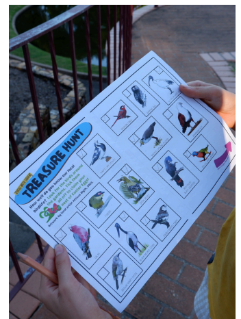
Left: Two keen easter egg hunters! Right: Our native bird themed scavenger hunt.