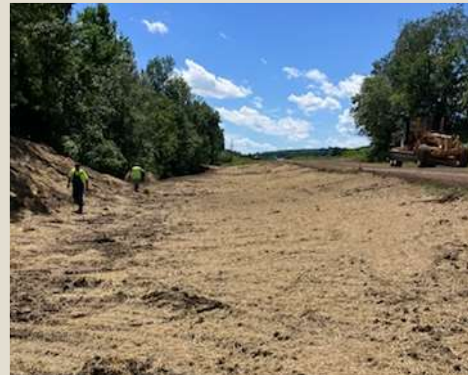
Working with Land Conservation on slope improvements, CTH H