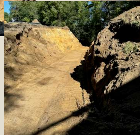
Culvert Replacement ST# 95