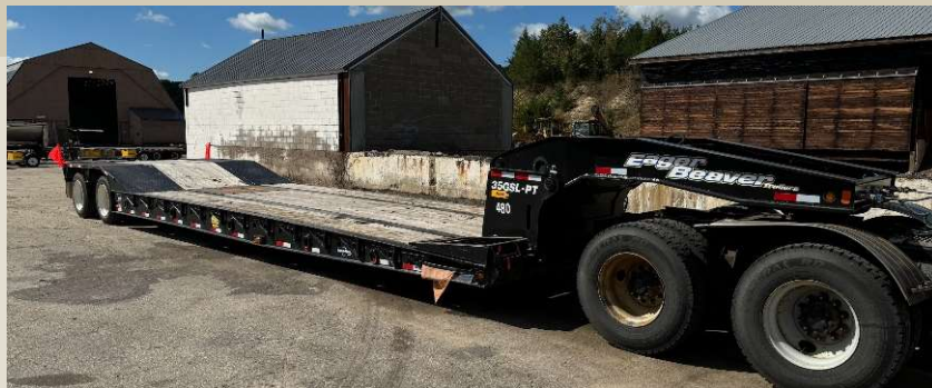
#4294 Used Trailer, from Taylor Co.