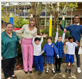
Summer Hill Public School toilets are getting a much-needed upgrade