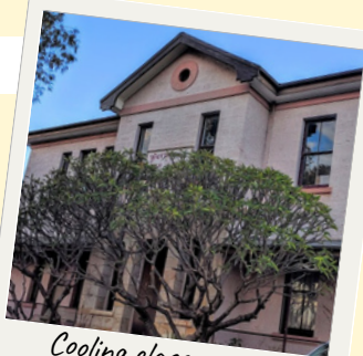
Cooling classrooms at Ferncourt Public School

More classrooms and spaces will be air conditioned at Dulwich High School of Visual Arts and Design , making it easier for students and teachers to learn and work through summer months.