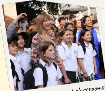
More air conditioned classrooms at Dulwich High School