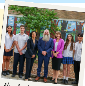
New facilities are coming to Marrickville High School

Marrickville High School is receiving $6 million from the high potential and gifted education school program for new learning and study spaces.