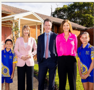
More space next to Ashbury Public School secure for future generations.