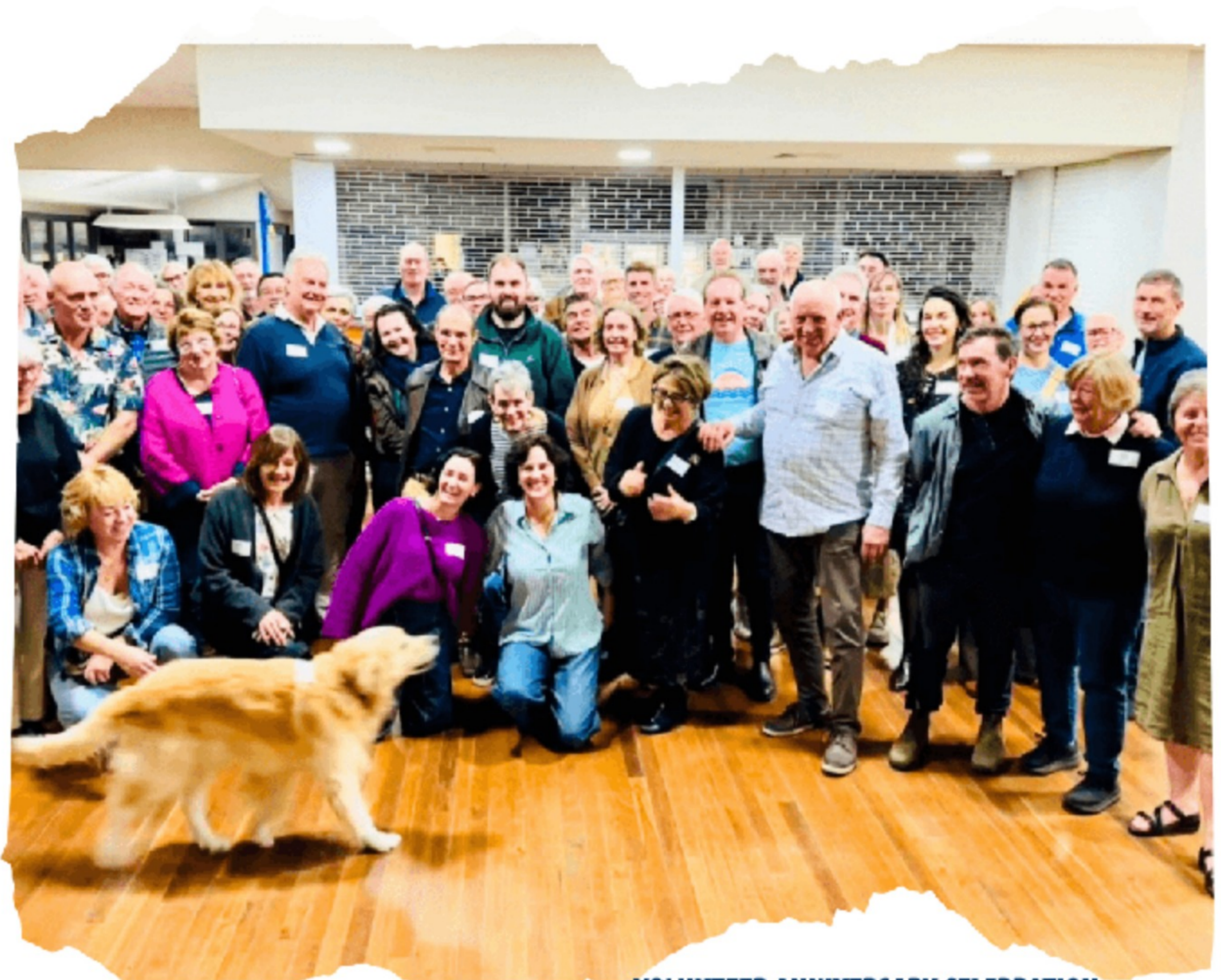
VOLUNTEER ANNIVERSARY CELEBRATION ONE YEAR ON FROM THE ELECTION!