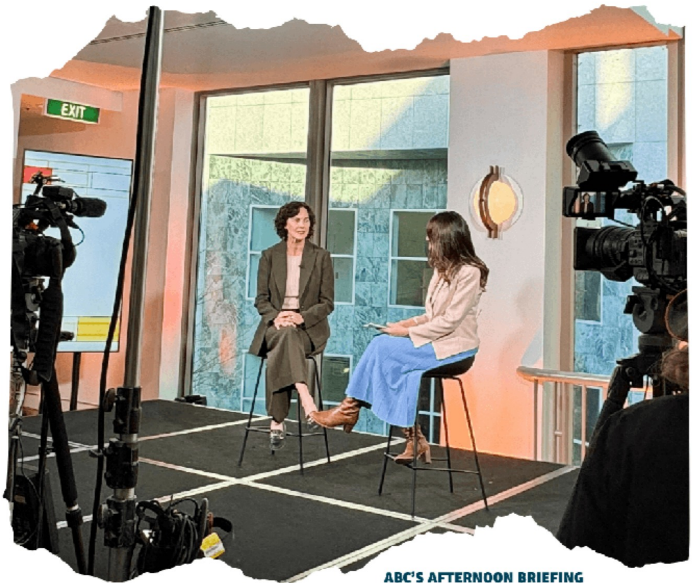
ABC'S AFTERNOON BRIEFING WITH PATRICIA KARVELAS ON BUDGET DAY

I've been pushing for reforms to negative gearing and the capital gains tax for housing since my first term. These concessions have overwhelmingly favoured wealthy property investors, causing housing prices to rise significantly. More than 80% of the CGT benefit flows to the top 10% of income earners. The changes in the budget – with regard to property – will level the playing field for owner occupiers. Housing should be a necessity, rather than an investment for wealth accumulation.