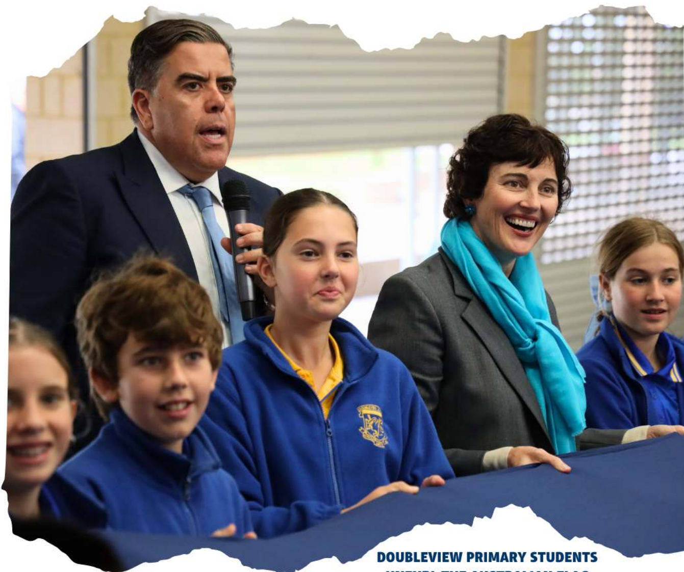
DOUBLEVIEW PRIMARY STUDENTS UNFURL THE AUSTRALIAN FLAG

I was pleased to host the Speaker of the House of Representatives, Milton Dick MP, in Curtin this month, as he visited Doubleview Primary School with the giant flag that flies above Parliament House in Canberra, as part of his parliamentary education program .