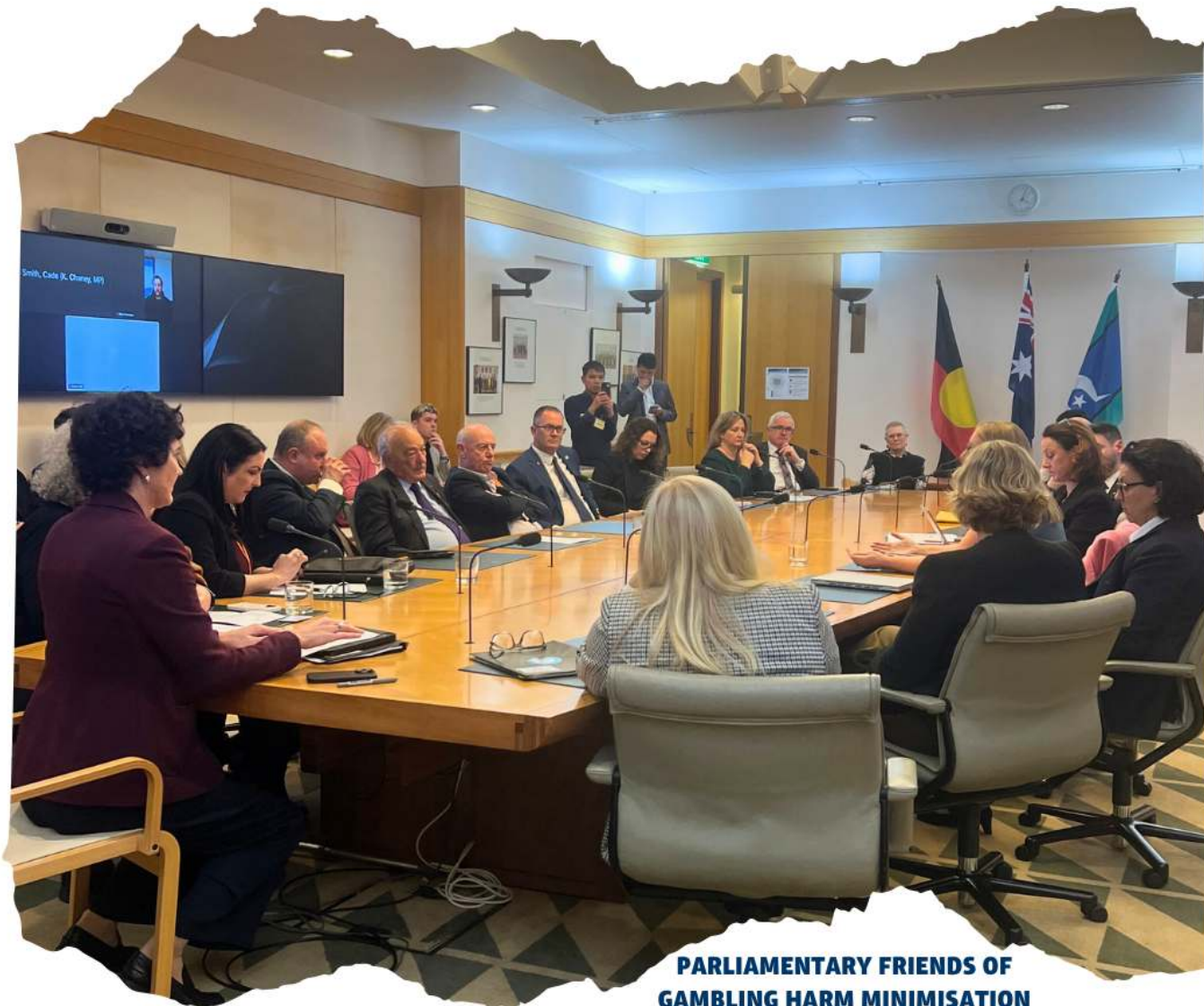
PARLIAMENTARY FRIENDS OF GAMBLING HARM MINIMISATION