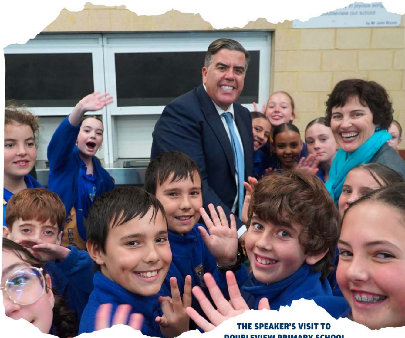
THE SPEAKER'S VISIT TO DOUBLEVIEW PRIMARY SCHOOL