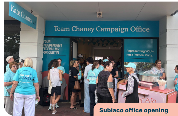
Subiaco office opening