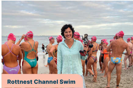
Rottneet Channel Swim

What a supportive community, right here in Osborne Park, building a creative and inclusive space. Check it out!