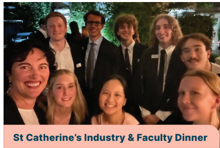
St Catherine's Industry & Faculty Dinner

It was a gusty afternoon for those competing for the coveted Cock of the Swan prize, for the fastest vessel on the river. Great to see many of our local clubs collaborating.