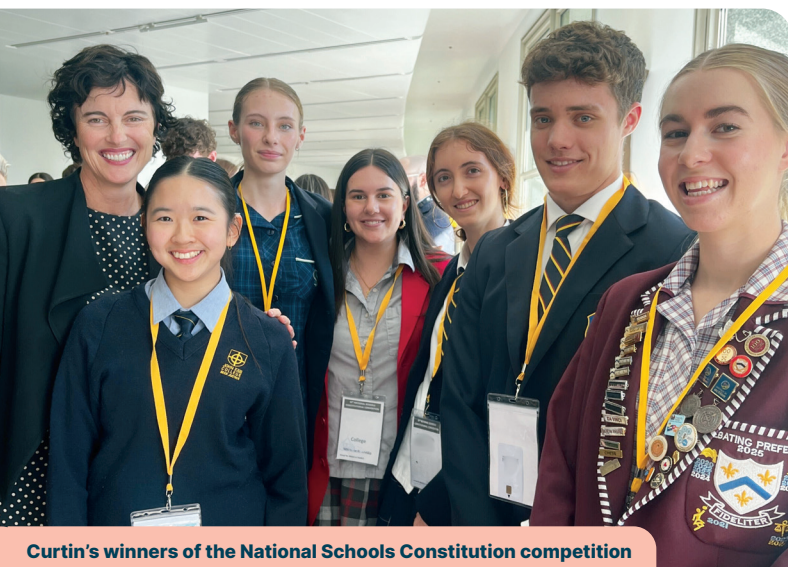
Curtin's winners of the National Schools Constitution competition

If you want to protect your personal information, apply for a postal vote via aec.gov.au