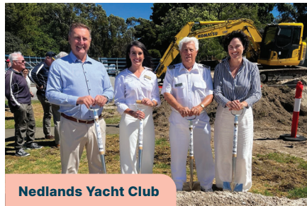
Nedlands Yacht Club

A really impressive group of St Cat's students turned up to hear about careers in politics and diplomacy – definitely some future leaders there.