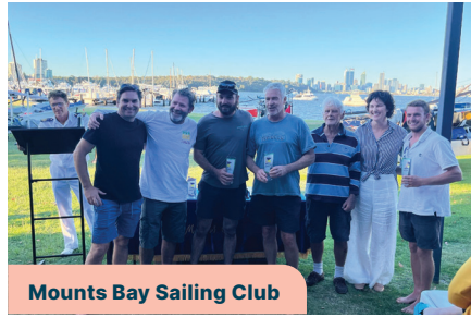
Mounts Bay Sailing Club