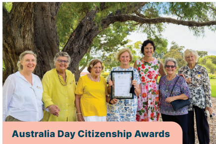
Australia Day Citizenship Awards

Well done to all who participated in the 2025 swim! Always an inspiring event.