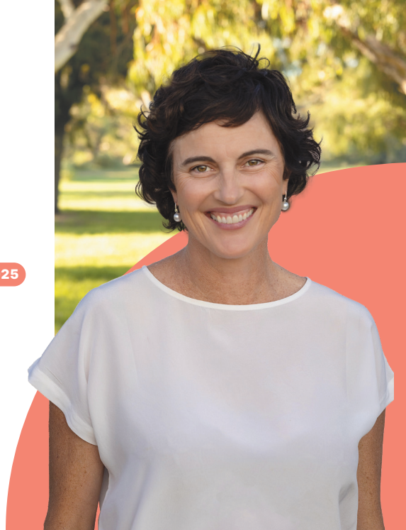
Kate Chaney MP

This election is about the kind of future we want for ourselves, our kids and our grandkids. Do we go back to a system where party politics comes first, or do we keep working towards a balanced, independent approach that puts our community and country's needs at the heart of decision-making? It really is up to you.