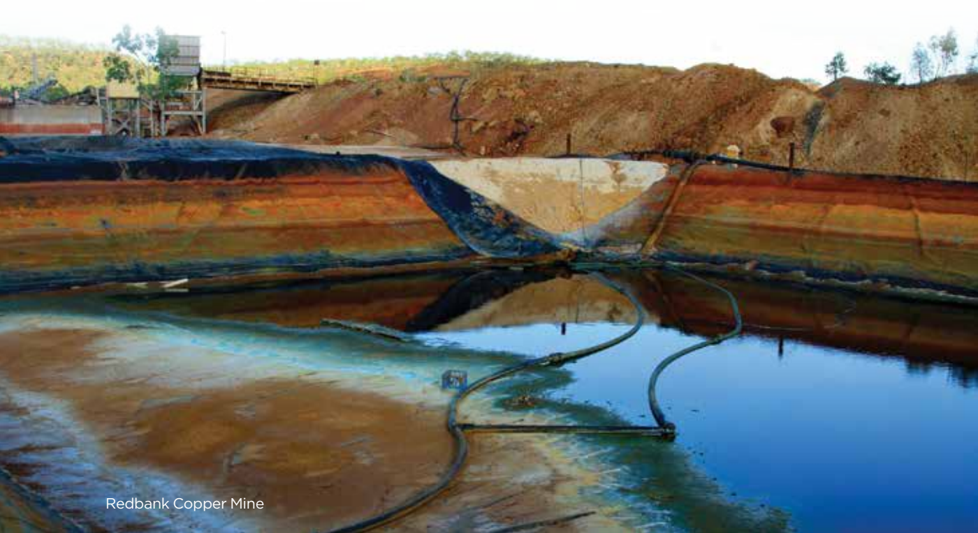
Redbank Copper Mine

The Northern Territory has a relative abundance of mineral rich deposits, both on the land and in the seabed. This has historically seen the mining and resources sector as the biggest sector of the Territory economy. 109 The mining and resources industry have not however created the most jobs. 110