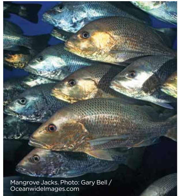
Mangrove Jacks.

Since 1985, some Australian trawl fishing effort occurred in the Top End, however, there is very little publicly available information about its regulation and impact.