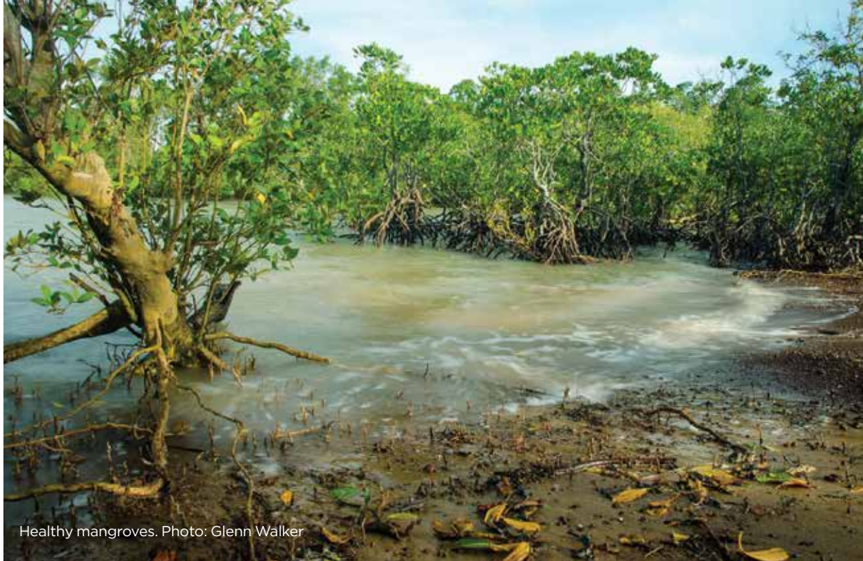
Healthy mangroves.

A good example of direct threats through clearing is the significant areas of mangroves cleared to facilitate the INPEX LNG project. That project cleared an area of 95 hectares of mangroves and high-intertidal communities. 64 Developers and government often use percentages of total mangrove areas in the Harbour to downplay the area they are clearing. 65 The areas, when looked at by hectares are usually large areas, despite only being a small proportion of the total mangrove coverage in Darwin Harbour.