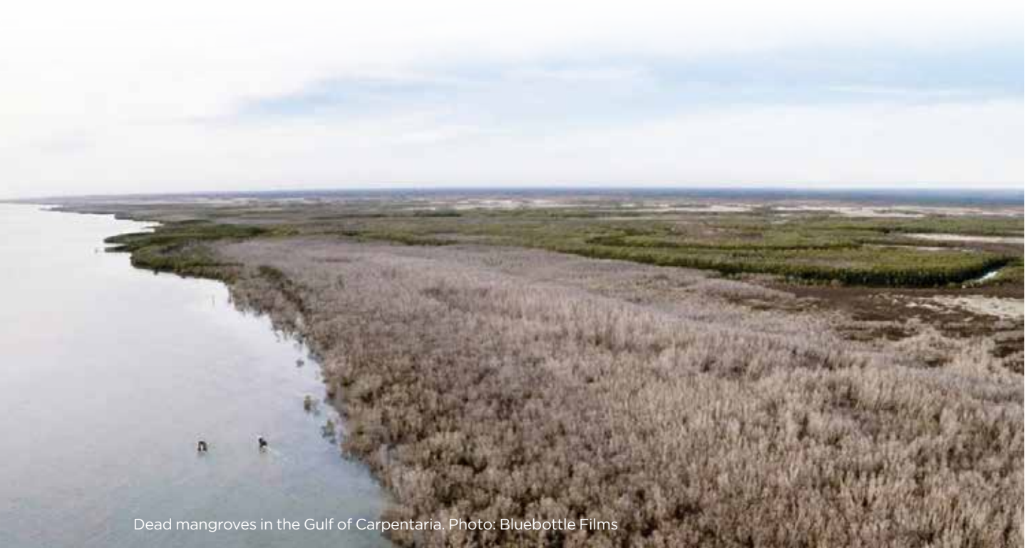
Dead mangroves in the Gulf of Carpentaria.

Climate change and, more specifically, adaptation to climate change, have received comparatively little attention in the Northern Territory. 122 The Territory is likely to experience more pronounced impacts (economically, socially and environmentally) from climate change than most other parts of Australia. 123 Because of this, it is critical that more work is done locally to drive action on climate change and to protect the Northern Territory's coastal zone.