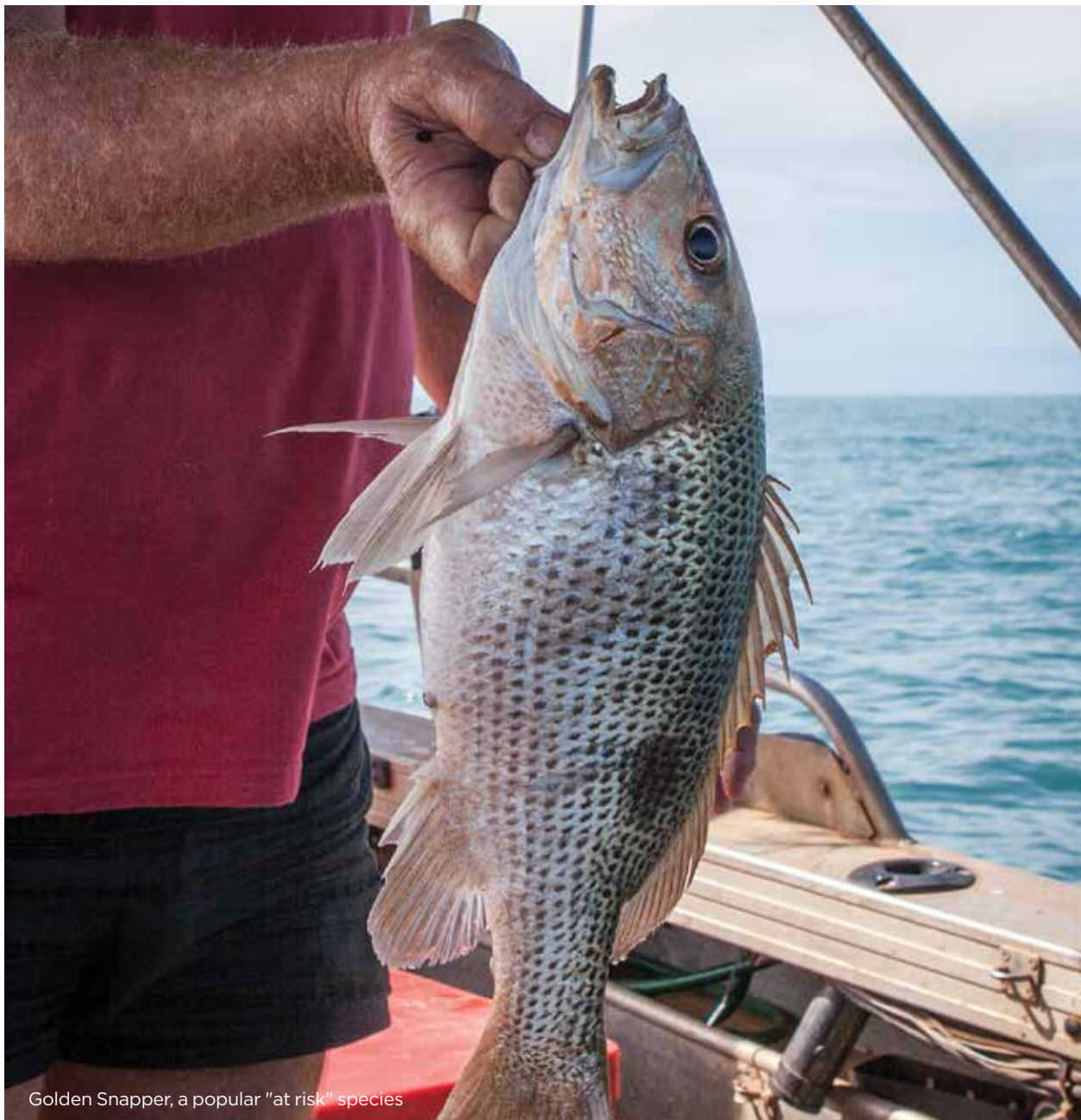
Golden Snapper, a popular “at risk” species