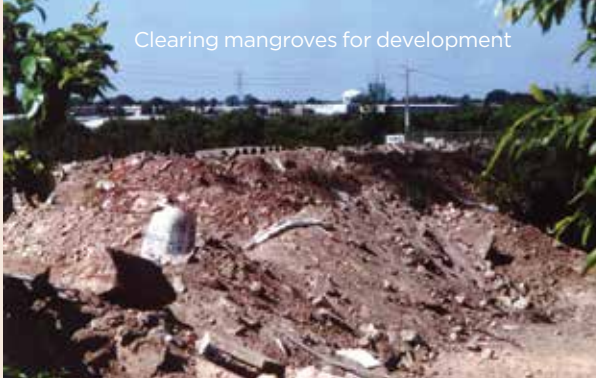
Clearing mangroves for development