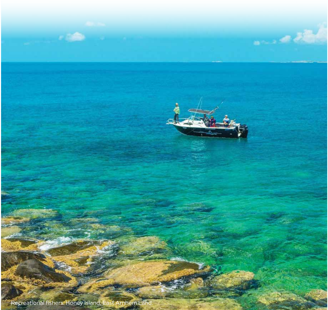
Recreational fishers. Honey Island, East Arnhem Land.

Recreational fishing is a vital and cherished activity in the NT, from both a social and economic standpoint. It is clear that a new era of greater science-based management intervention has arrived, and that the relative isolation and low coastal population of Territory waters are no longer able to contain the impacts – and ensure the benefits – of recreational fishing into the future.