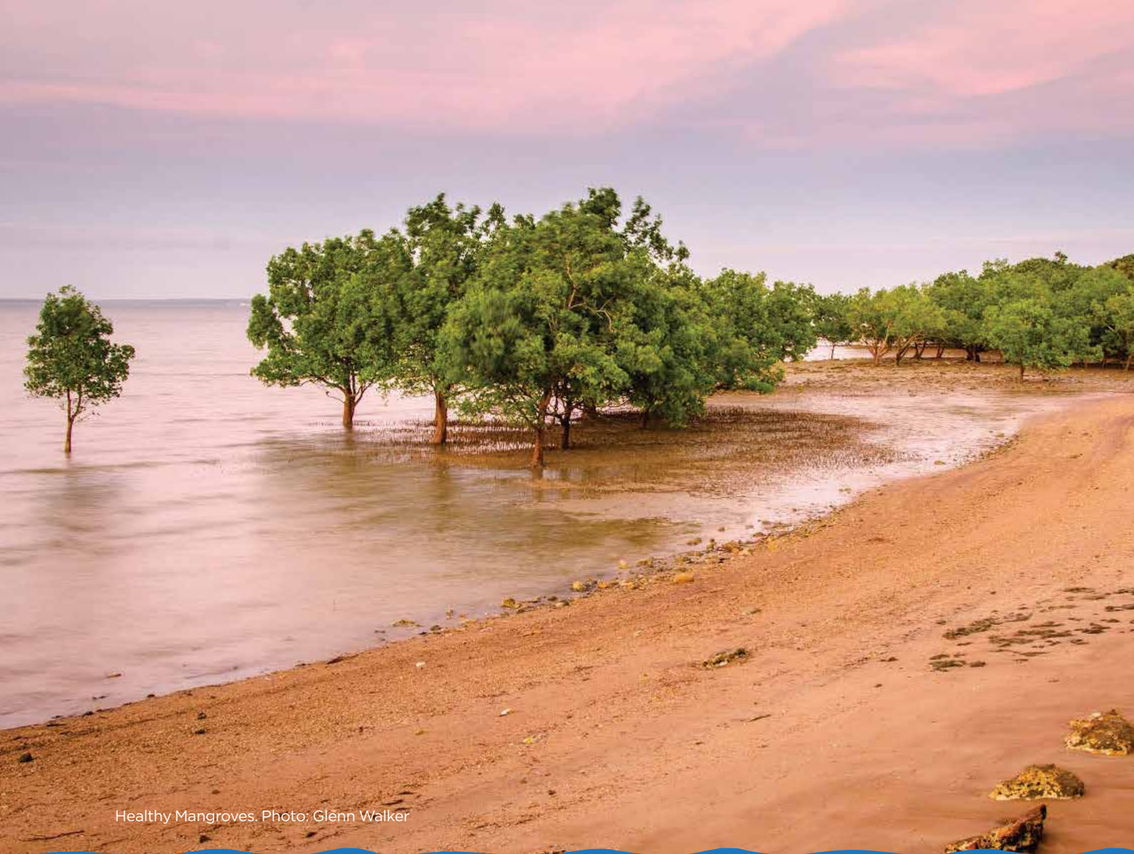
Healthy Mangroves.