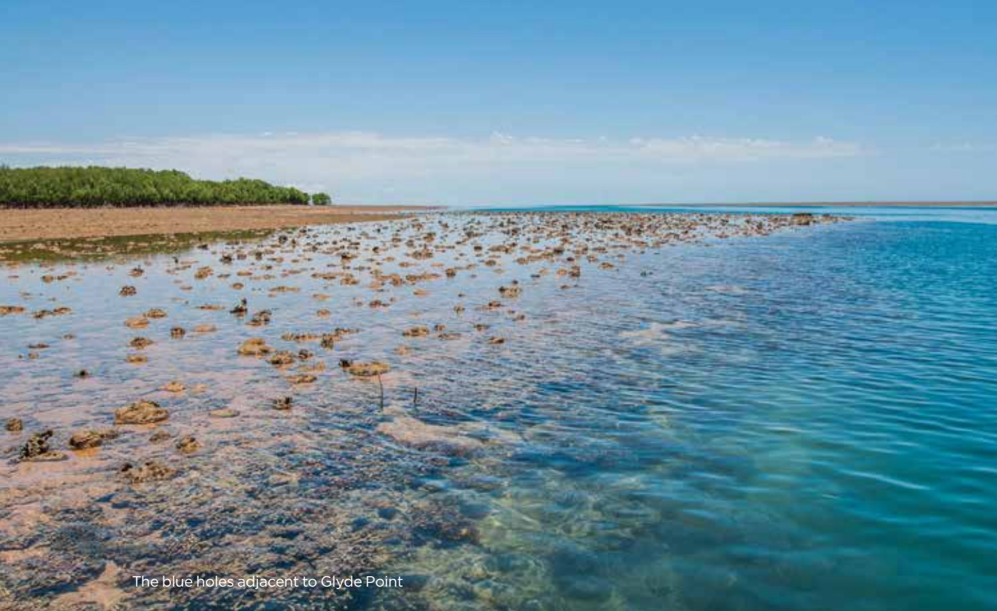
The blue holes adjacent to Glyde Point