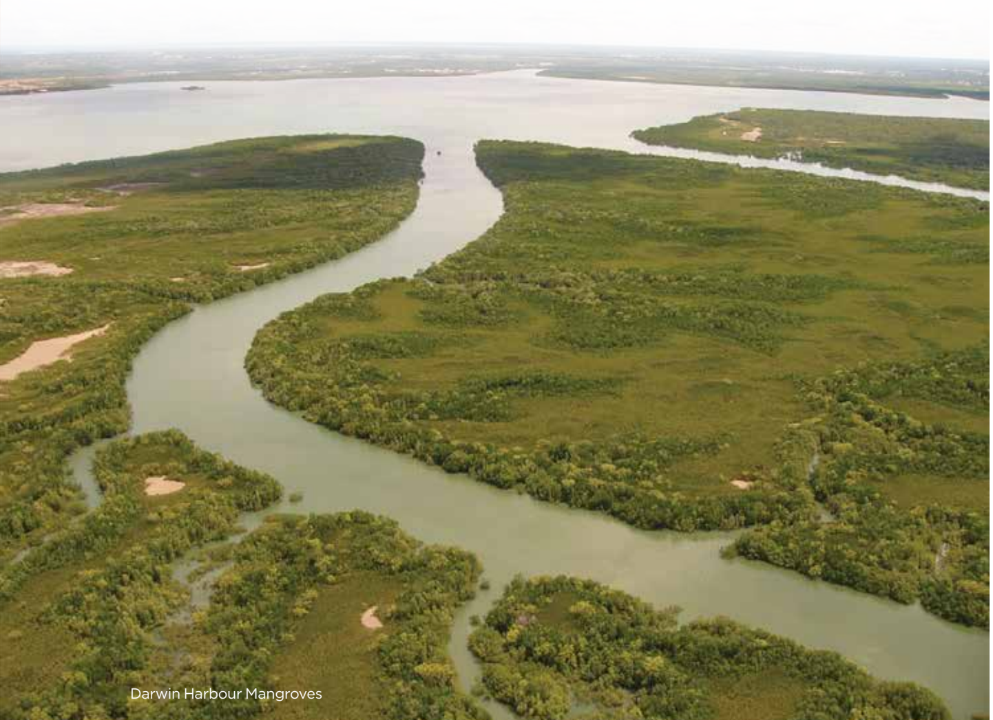
Darwin Harbour Mangroves

The Northern Territory is blessed with approximately 4120 km 2 of mangrove forest, which includes approximately 35-40% of Australia's mangrove species. The mangroves in Darwin Harbour are the most diverse in Australia, with 36 different species. Mangroves are at once tough and vulnerable. While mangroves provide critically important habitat and outstanding natural protection for coastlines, from storm surge and cyclones, they are more vulnerable than ever to development pressures 52 and increasingly affected by a changing climate in the Top End. 53