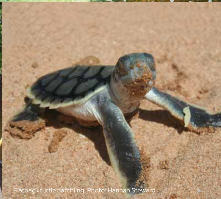
Flatback turtle hatchling.