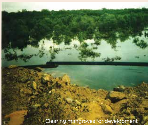
Clearing mangroves for development

The Land Clearing Guidelines do class mangroves as “sensitive and significant vegetation” and recommend against the clearing of mangroves, however, they do not prohibit it and simply require applicants to demonstrate how they have minimised the area to be cleared. In any event, recent experience has shown that the Government takes a lax approach to application of the requirements of the Land Clearing Guidelines. 59