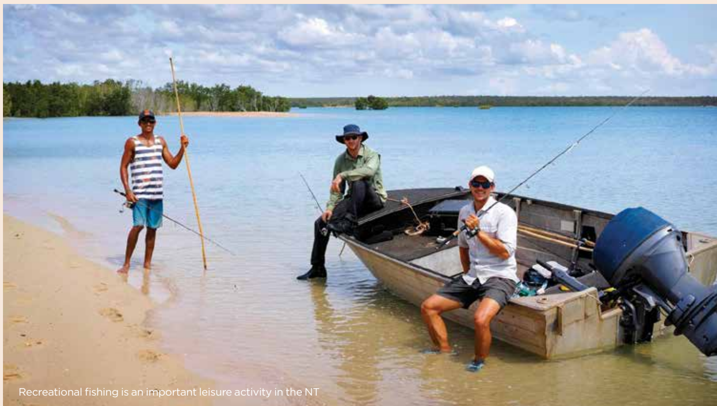
Recreational fishing is an important leisure activity in the NT

Fishing, be it recreational, Indigenous or commercial, plays a fundamental role in the Northern Territory community. A 2003 report found that almost 32% of the Northern Territory's population took part in recreational and Indigenous fishing between May 1999 and May 2000; the highest percentage of any state or territory in Australia. 72 According to the Northern Territory Seafood Council, commercial fishing in the NT is worth more than $78 million per year. 73