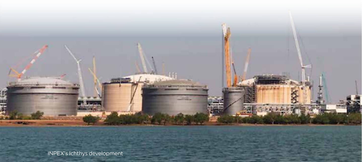
INPEX's Ichthys development

Ichthys is an oil and gas development, thus its operation has the potential to introduce large volumes of hydrocarbons into the Darwin Harbour if it is incorrectly managed.