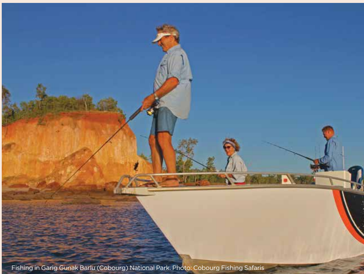
Fishing in Garig Gunak Barlu (Cobourg) National Park.