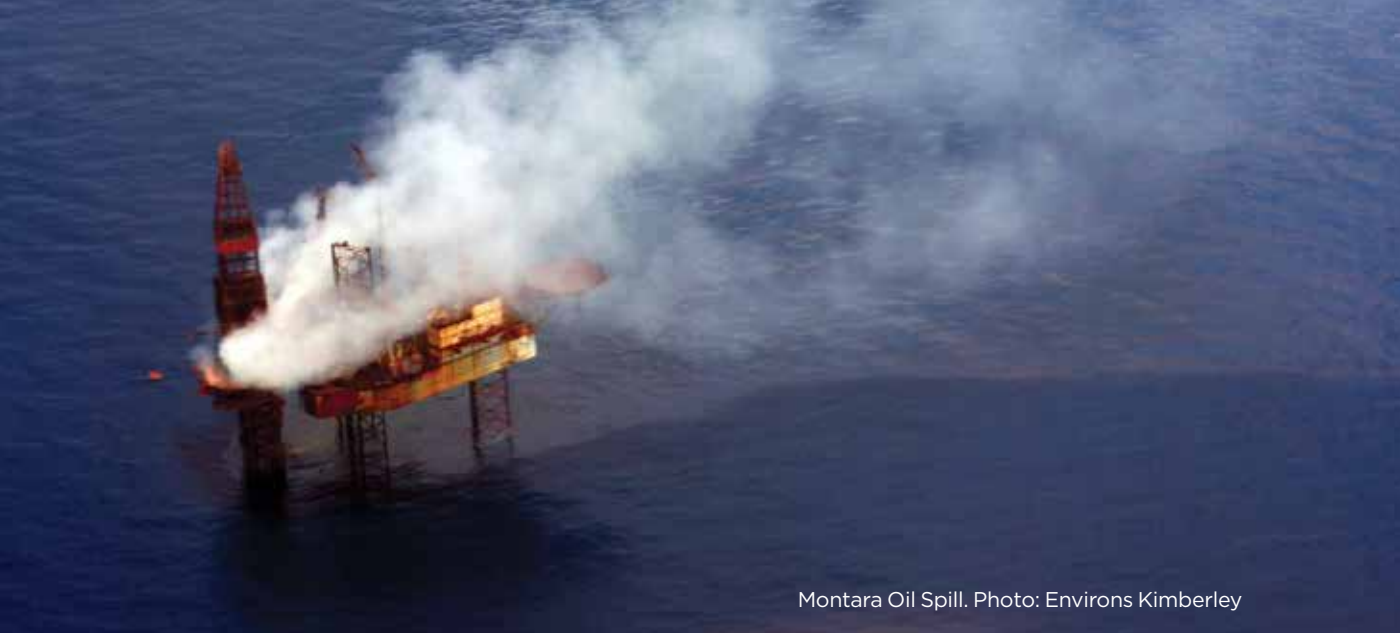
Montara Oil Spill.