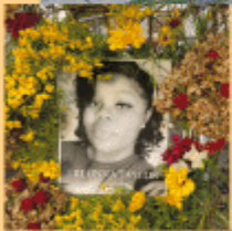
sojourner truth day