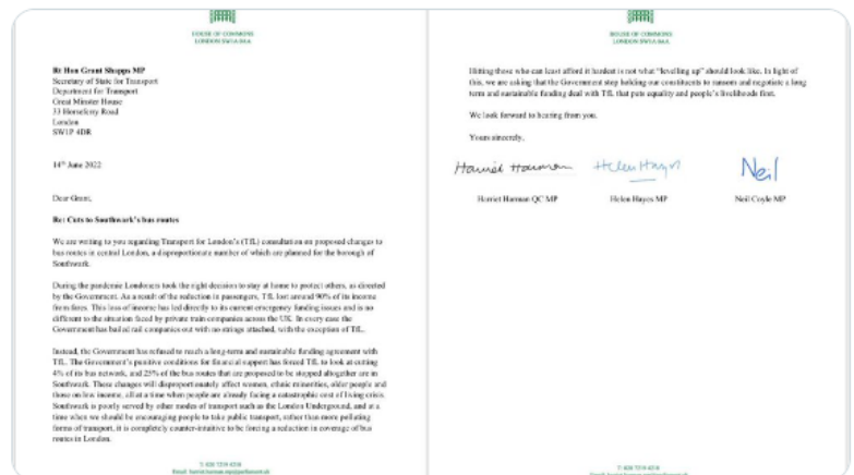
Harriet Harman · Jun 1

Cuts to bus routes hit hardest those who can least afford it. My, @helenhayes and @coyleneil 's letter to Transport Sec @grantschapps protesting Govt failure to fund @TfL . This is not levelling up. 🇬🇧