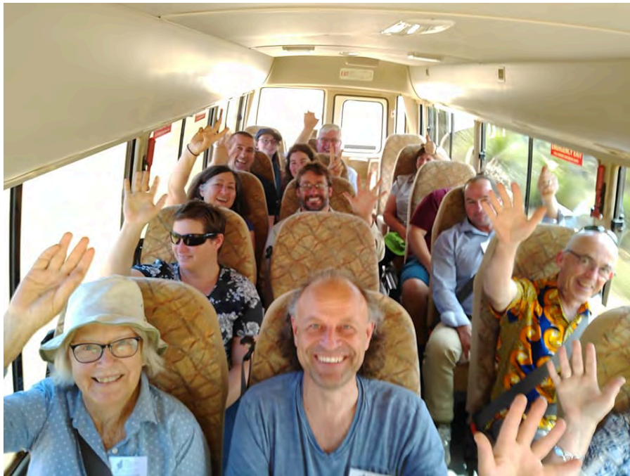
WALN AGM and Network Gathering Field Trip Perup: Nature's Guesthouse 15-16 November 2018

WALN hopes to increase its Ordinary Membership for community landcare groups as well as welcome aboard Associate Members during 2019-20.