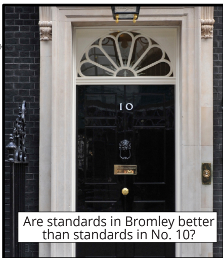
Are standards in Bromley better than standards in No. 10?

We have been shocked at the behaviour of the Conservative government, it feels like it's one rule for them and a whole different set for the rest of us.