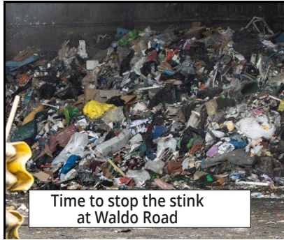
Time to stop the stink at Waldo Road

From a survey of over 200 local residents, 85% said that traffic congestion was a major concern and 74% said the smell was an issue.