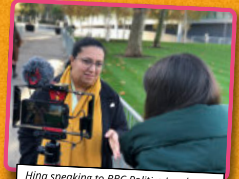
Hina speaking to BBC Politics London about the City Hall move