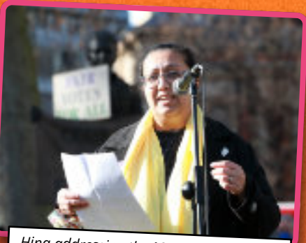
Hina addressing the Make Votes Matter protest in Parliament Square