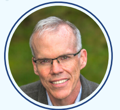
Bill McKibben author, educator & environmentalist