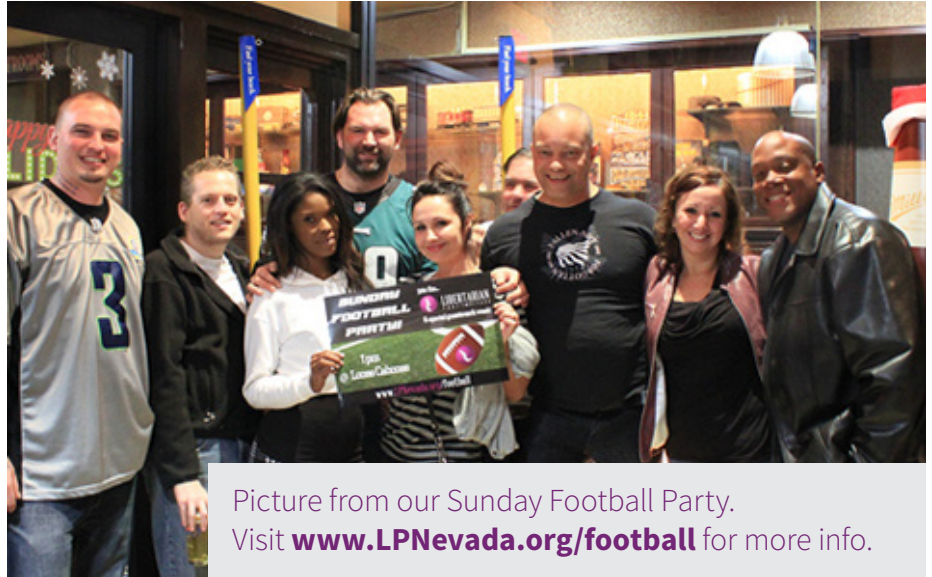
Picture from our Sunday Football Party. Visit www.LPNevada.org/football for more info.