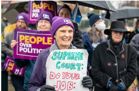
League members at the December 7, 2022, Supreme Court Rally: