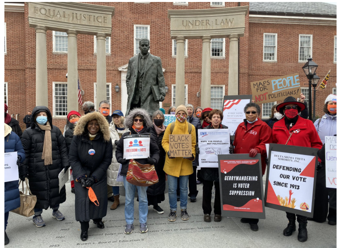
League members join other redistricting advocates at a redistricting rally in Annapolis in 2022