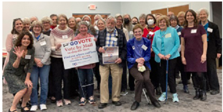
LWVFC current and prospective members at Frederick County library's downtown branch, January 2023

The League looks forward to a productive year with an active membership that includes new members as well as several with decades of League experience. LWVFC is thrilled that the state League invited Frederick to host the annual convention in June and they look forward to showcasing the county and the county League.