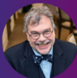
Peter Hotez, MD, PhD