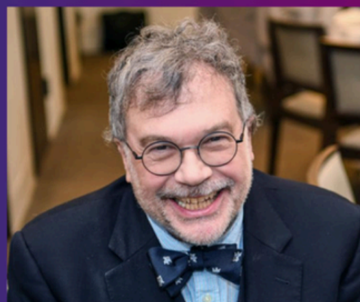
Peter Hotez, MD, PhD

Vaccine Scientist & Dean, National School of Tropical Medicine