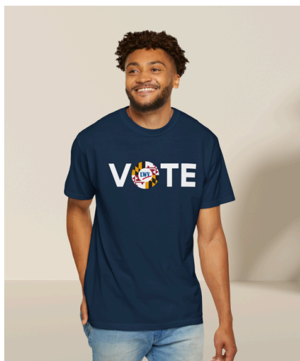
LWVMD VOTE T-SHIRT