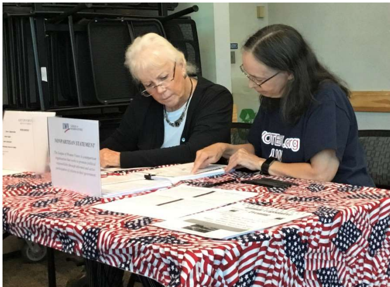
Voter Registration Events