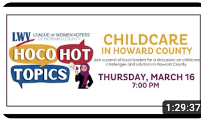
HoCo Hot Topics Child Care Resources March 16, 2023