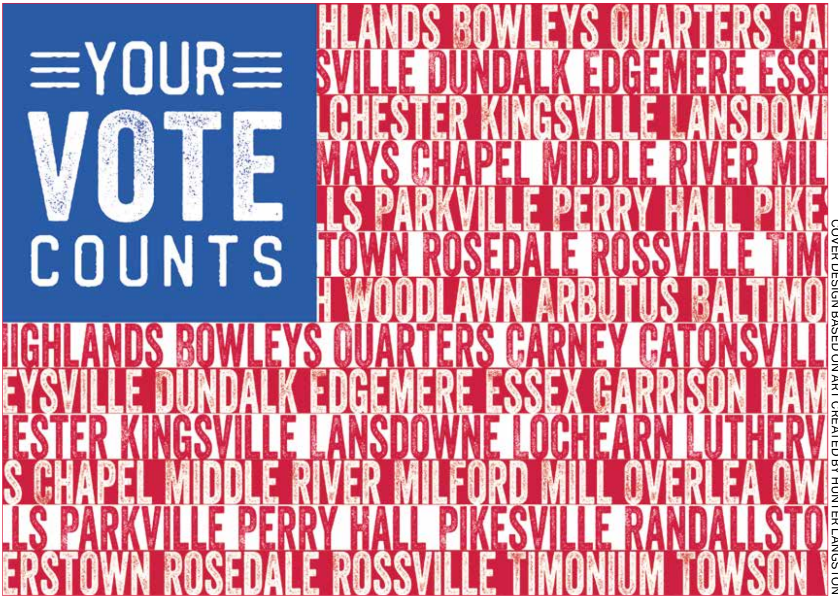
COVER DESIGN BASED ON ART CREATED BY HUNTER LANGSTON

EARLY VOTING ★ JUNE 11-18, 7:00AM - 8:00PM